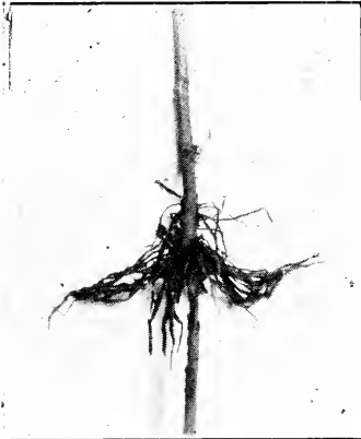
Round-Root layer before cutting from tree.

These Round-Roots are meeting a demand from growers that we have had for a long time. These layered trees are developed by a method which we spent four years in trying out. When we were sure that the method was better than anything before developed in filberts we offered them to the public.