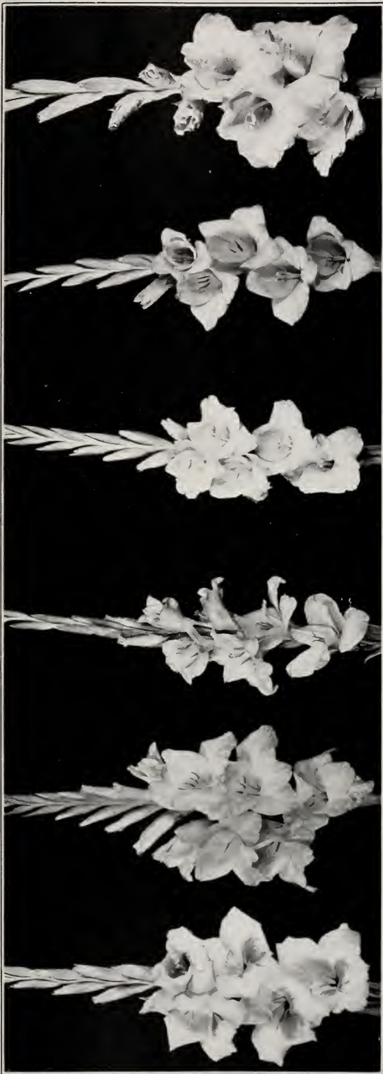
Robert the First