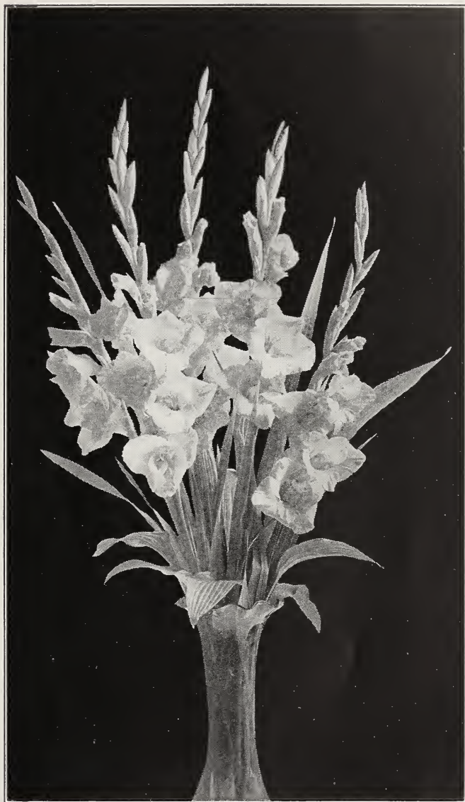
E. I. FARRINGTON (One of the Best New Yellows)