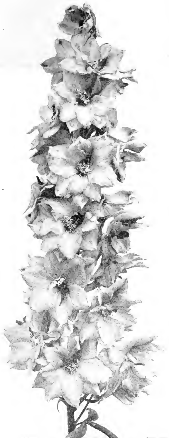
Branch Lateral of Shaw Strain Delphinium

From three-inch pots, varieties No. 249, $2.50 per dozen; $18.00 per hundred. No. 250 to No. 265, $1.50 per dozen; $11.00 per hundred. No. 266 to No. 275, $1.25 per dozen; $9.00 per hundred. Small Delphinium plants shipped express, charges C. O. D. We cannot be responsible for any green plants shipped by us by express or parcel post, as plants leave our hands and are packed in the best way possible, but due to careless handling of railway and postal employees, delays, conditions that cause plants to sweat thereby causing their loss. All green plants shipped are entirely at the purchasers risk.