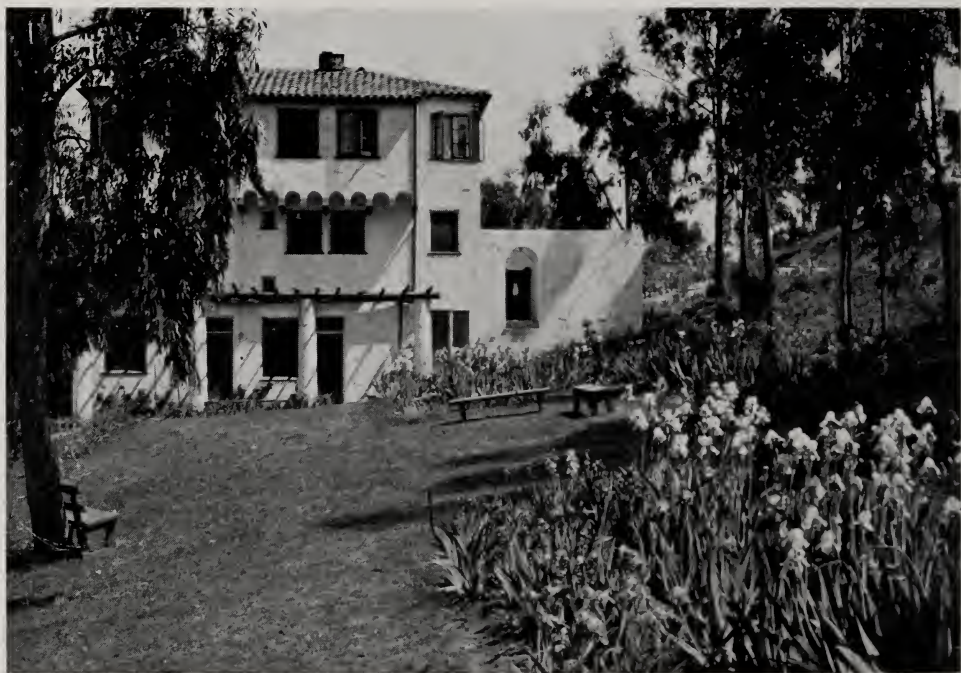
A corner of the Salbach Garden