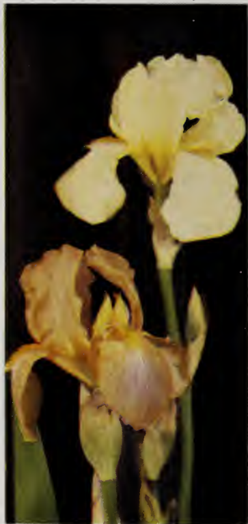
Valencia Yellow Moon

The prices in this catalog cancel all previous quotations