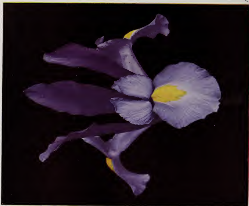
JACOB DE WIT