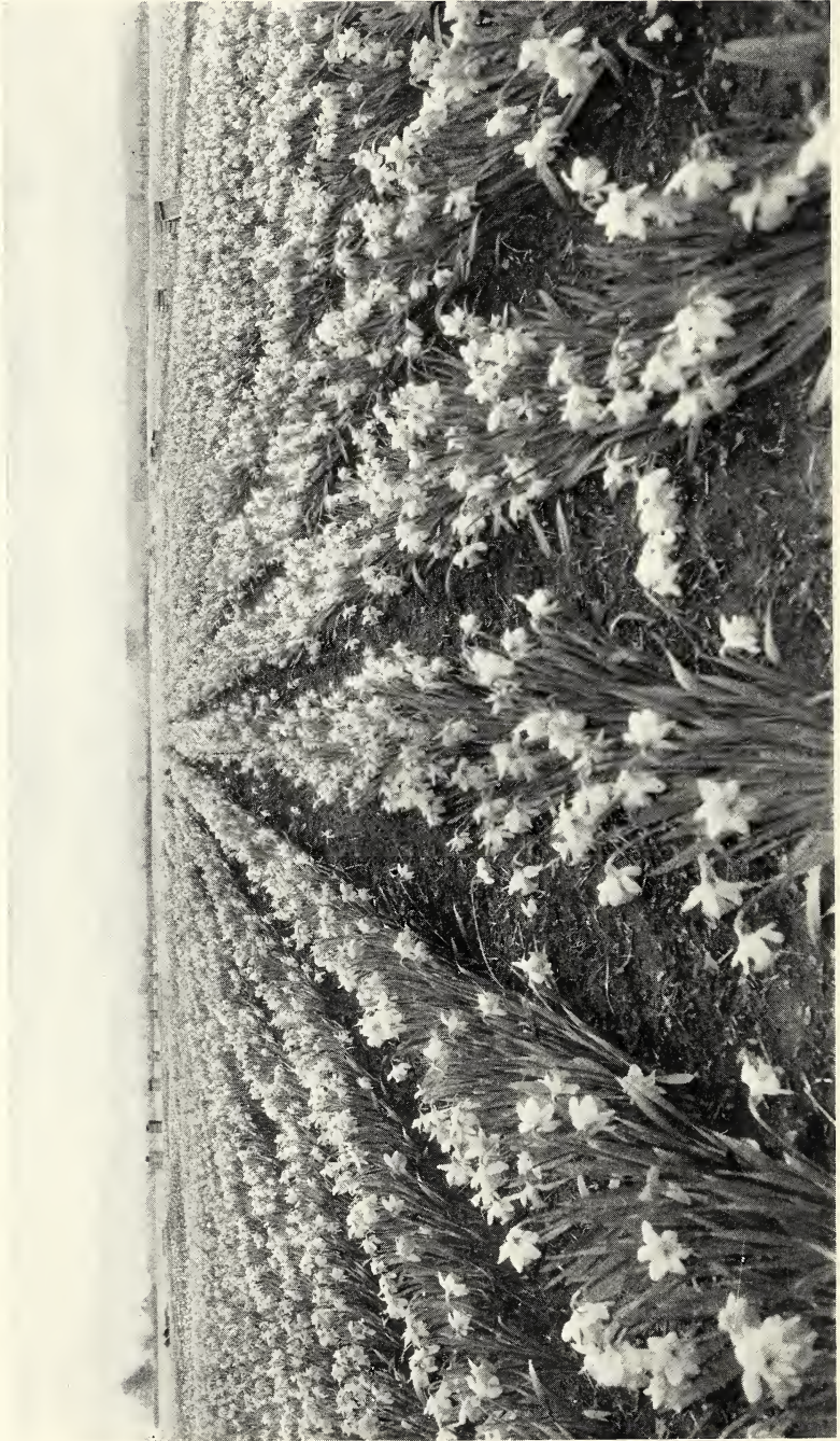
A Field of Narcissus, Spring Glory, at our Woodland Wash. Bulb Farm