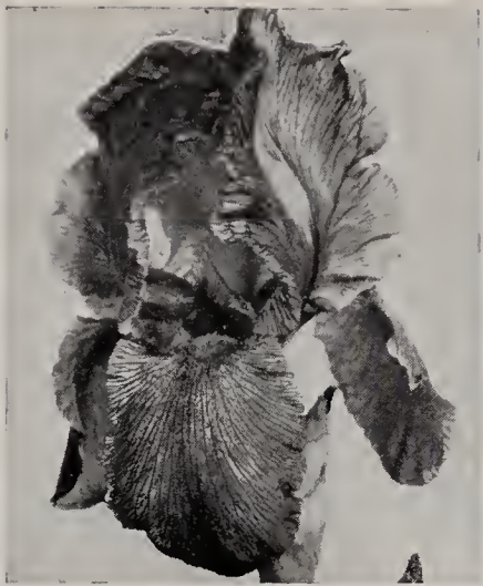
Iris Wm. Mohr