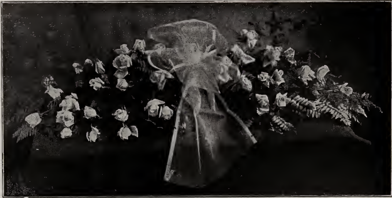
Double Spray Roses $6.00, $8.00, $10.00, $12.50, $15.00