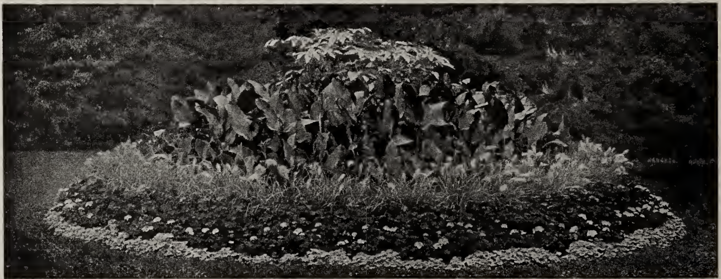
Bed of Castor Beans, Cannas, Pennisetum, Longistylum, Geraniums and Mme. Sallerol Geraniums, 10 Feet in Diameter.

WIRE BASKETS filled for porch or for grave use, $1.00, $1.50, $2.00, $3.00 by express.