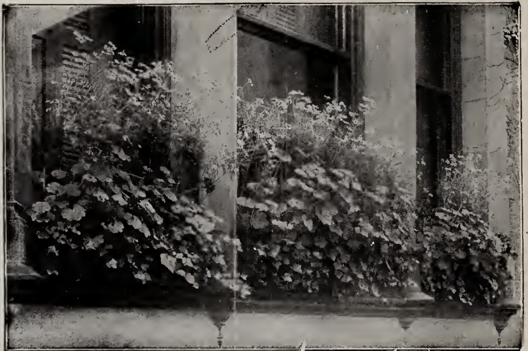
Daisies and Geraniums with English Ivy

C-1. Suitable for 2-foot box: 2 Boston Ferns, 3 Geraniums, 2 Daisies, 4 Vincas, all strong plants, $2.00. For a 3-foot box, $2.50. For a 4-foot box, $3.00.