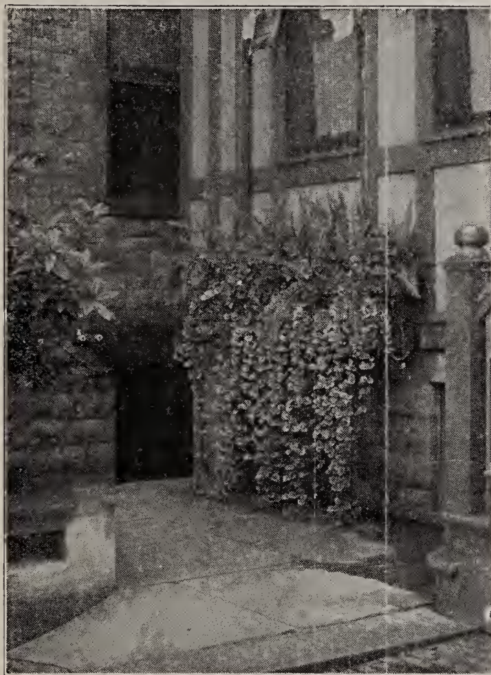
Vinea with Boston Ferns in center.

GIANT FLOWERED. Most beautiful and decorative of all pot plants, for winter and spring blooming. Foliage broad, massive and graceful, dark green, beautifully variegated with silver and rose. The flowers are carried on long stems and produced in profusion for several months. First size, separate colors, suitable for next winter's bloom at 20c each. 3 for 50c. Large size in fall, 50c and $1.00.