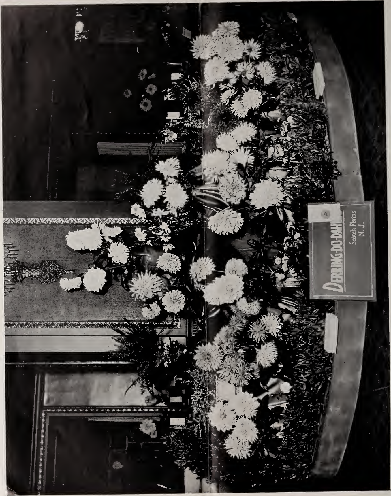
This Display Won First Award (50-100 ft.) at the 18th American Dahlia Society Show, Hotel Pennsylvania, Sept. 21st & 22nd, 1932. It was repeated at the Irvington, N. J. Show, where it also won First Award, N. J. Florist Medal.