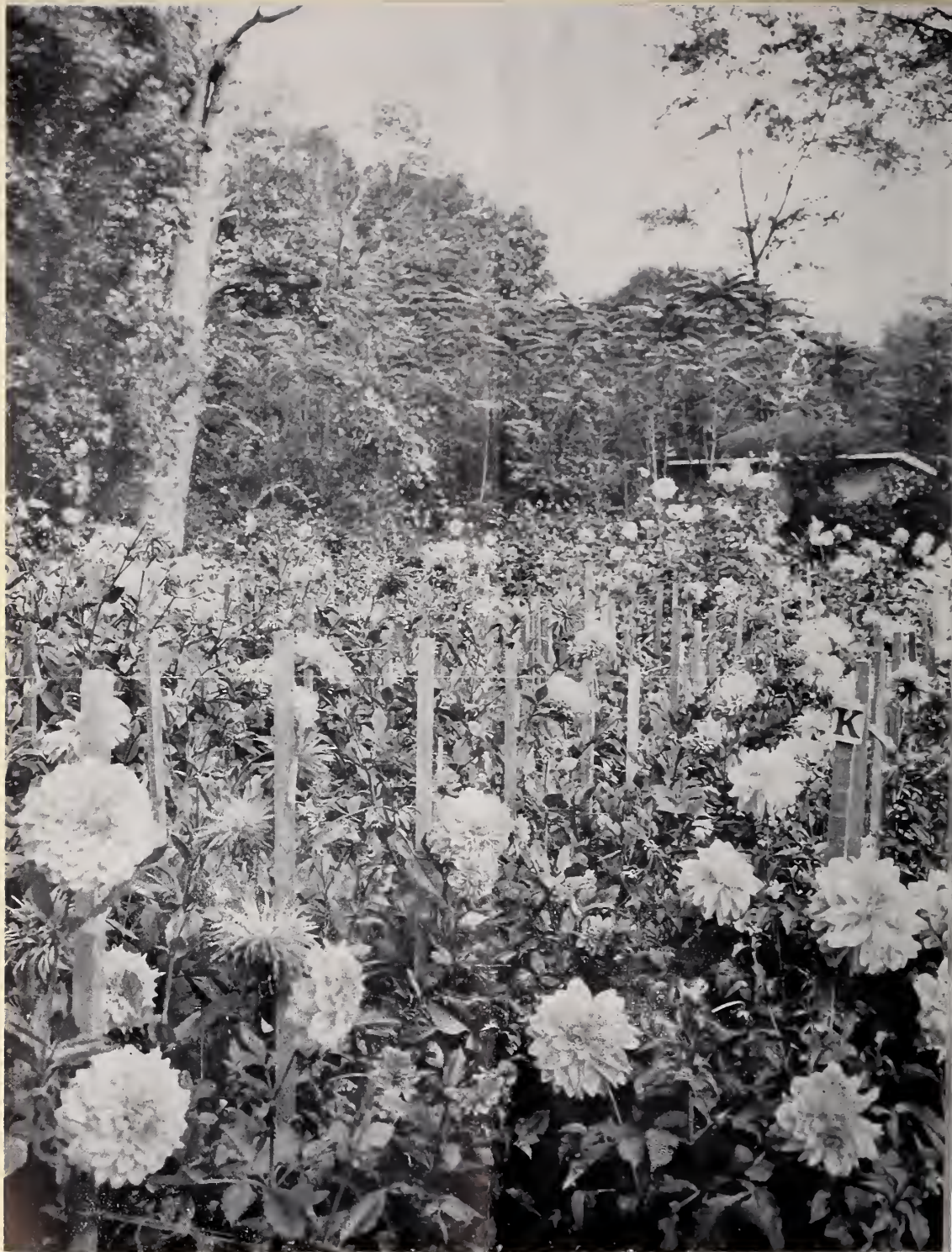
THIS IS THE RESULT OF FOLLOWING THE DERRING-DO DAHLIA GUIDE