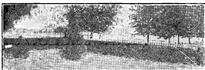
Arbor Vitae Hedge and Sheared Specimens

Globe Arbor Vitae (Thuja Occidentalis Globosa) We grow nothing but the Woodward's Globe Arbor Vitae. This is a far superior strain to the common Globe Arbor Vitae in that it is far more dense and compact growing. Woodward's Globe Arbor Vitae is a dwarf ornamental tree, growing absolutely round or globular. Just the tree for foundation plantings, or in any formal planting. These trees are not grown from seed but from cuttings.