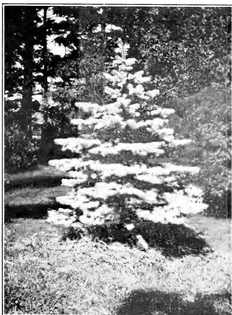
Colorado Blue Spruce