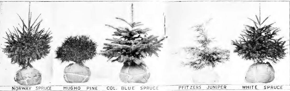
A Few of Our Specimen Balled and Burlapped trees