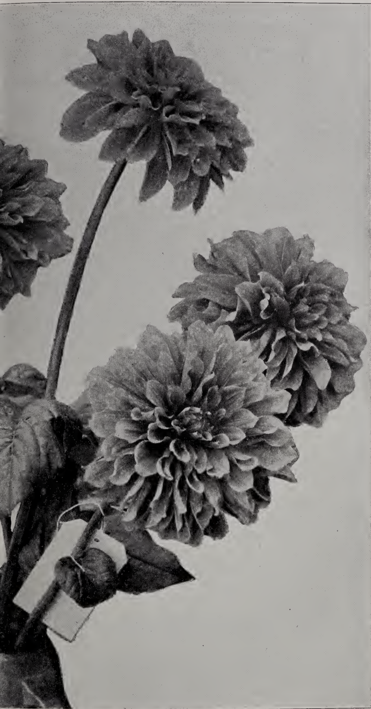
-Honor Roll Dahlia