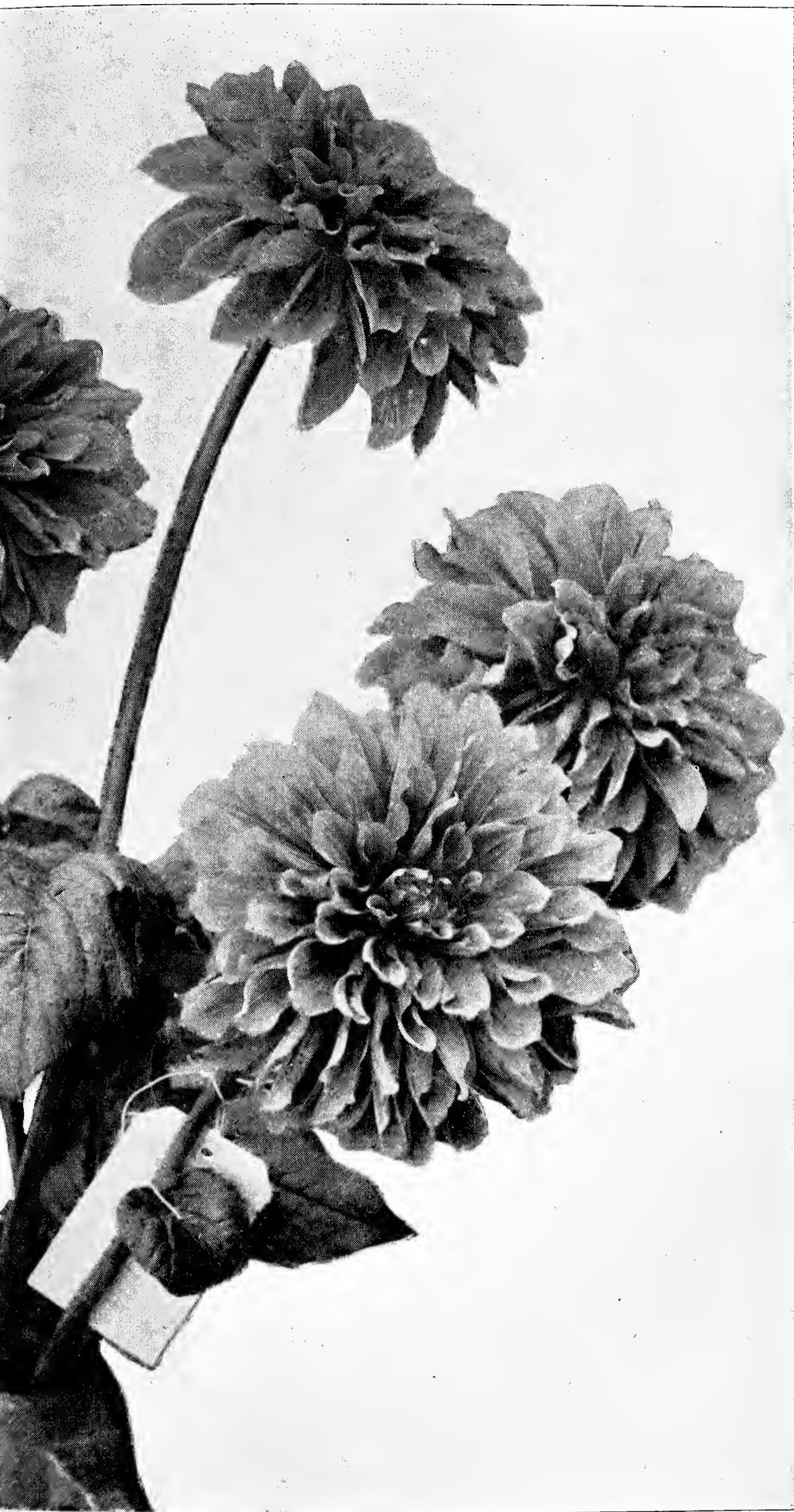
-Honor Roll Dahlia