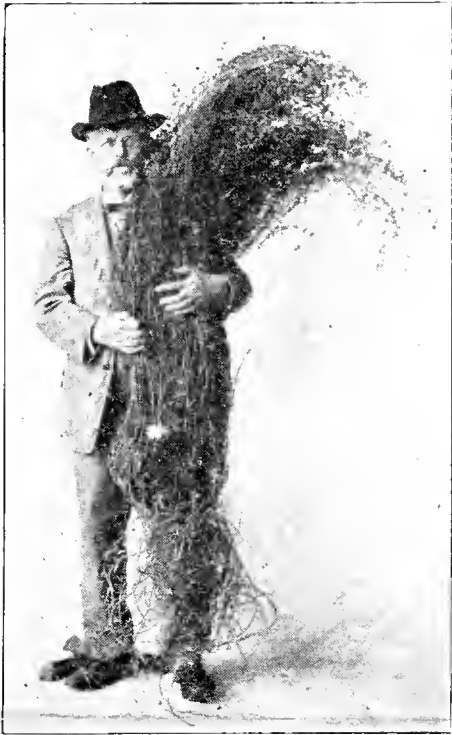
Prof. N. E. Hansen And A Single Plant Of Cossack Alfalfa

10 lbs. $1.25; 25 lbs. $2.50; 50 lbs. $4.50; 100 lbs. $8.50; 150 lbs. $12.00