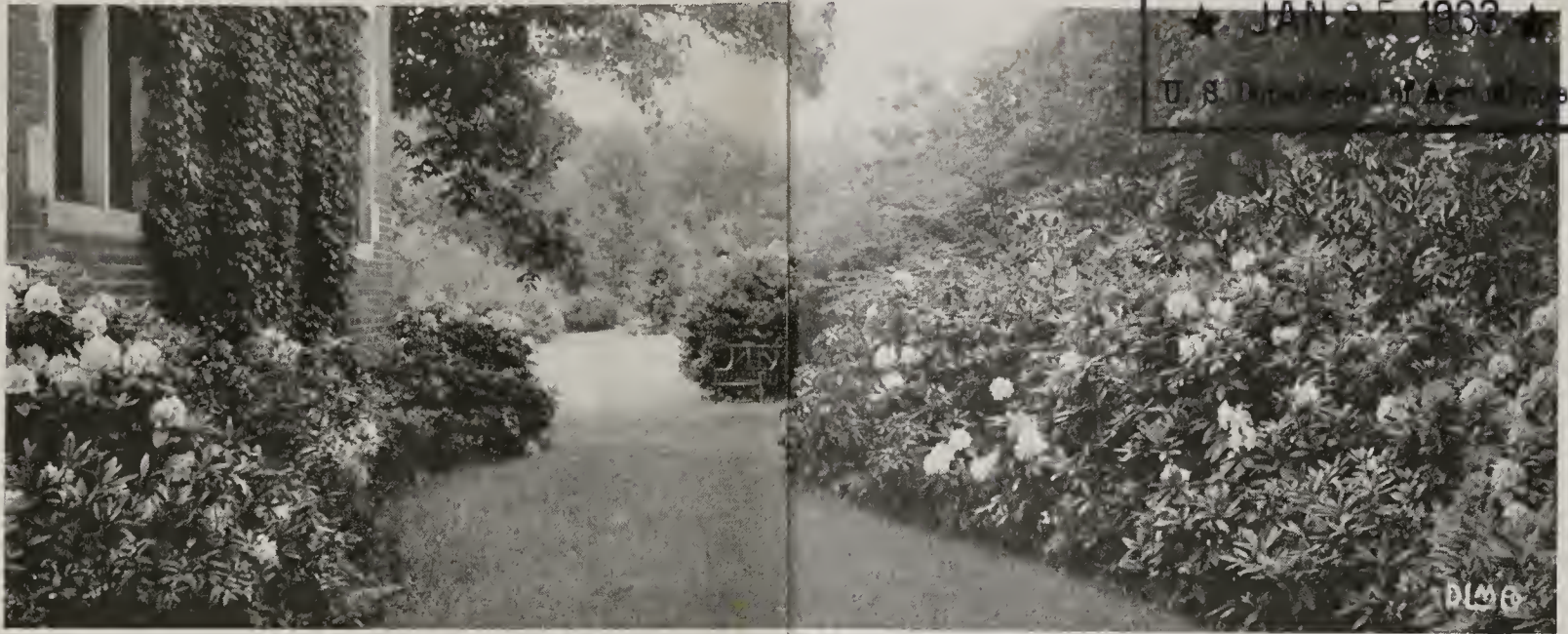
PLANTING OF RHODODENDRONS