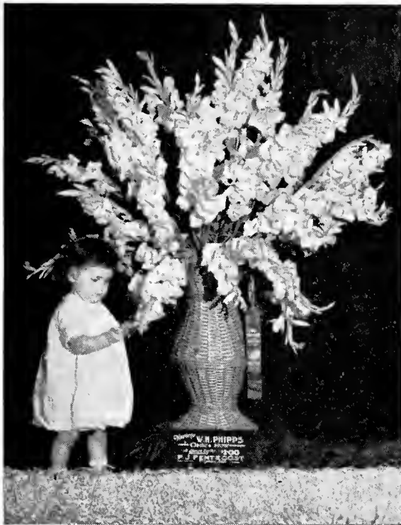
PHIPPS, the GLAD that put the AD in GLADMOOR