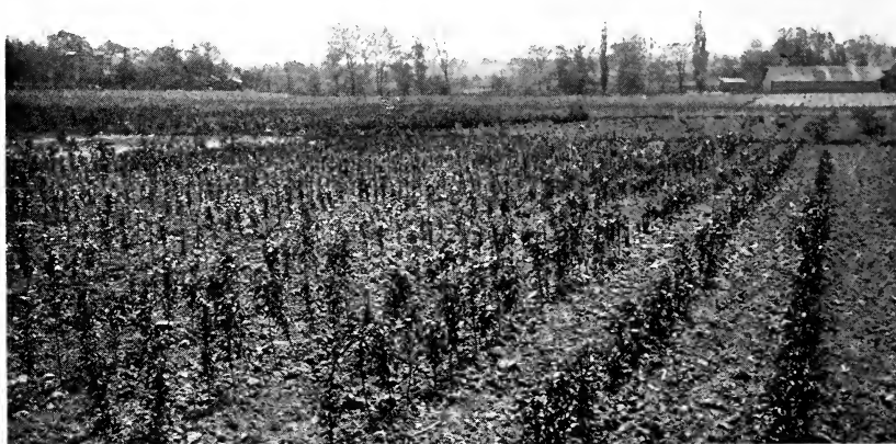
A SEEDLING NURSERY

The New York State Agricultural Experiment Station is trying to breed pears less susceptible to blight than sorts now grown. Seckel, being fairly free from blight, and with splendid tree and fruit characters, is the parent that has been commonly used in the Station's breeding work. Several Seckel seedlings are now being propagated as in some measure meeting the requirements set for a variety of sufficient merit to be introduced.