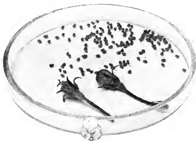
BREEDING A NEW APPLE

Sweet Delicious fruits are flatter than those of Delicious—large and attractive in size, color, and shape, with the sweet aromatic flavor of Delicious. The variety is an apple for home use where it will be chiefly appreciated for dessert and baking.