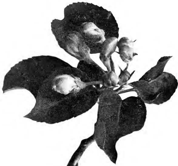
BREEDING A NEW APPLE Buds Ready for Emasculation

Lodi is a cross between Montgomery and Yellow Transparent. The tree is of the type of Yellow Transparent, but draws upon Montgomery for increased vigor and size. The fruits are of the type of Yellow Transparent but are larger and ripen a little later. The variety is an improved Yellow Transparent.