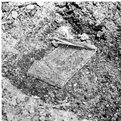
BREEDING A NEW APPLE

Sure Crop was imported from New Zealand and so far is the most promising nectarine at the New York Experiment Station. The tree is vigorous and productive. The fruits are large, roundish, white and overlaid with very attractive red. The flesh is firm, tender, free from the stone and very pleasing in flavor; late midseason. Sure Crop will probably suit the palate and the eye better than any other of the several delectable nectarines here listed.