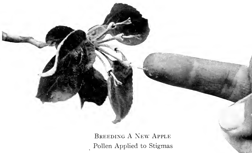
BREEDING A NEW APPLE

Emperor Francis is a cherry of the Napoleon type to precede that variety. The cherries are larger and much better in quality than those of Napoleon. The color