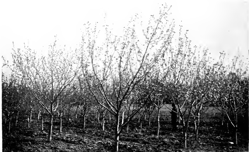
SEEDLINGS GROWING IN THE ORCHARD

Formosa is a Japanese plum recommended for its productive trees and large fruits. The plums are oval to slightly cordate, greenish yellow nearly overlaid with red; flesh firm, juicy, melting, pale yellow, sweet and good; stone slightly clinging; ripens midseason. It would be hard to find a more beautiful plum.