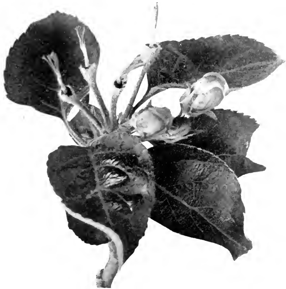
BREEDING A NEW APPLE Buds After Emasculation

Red Sauce is a large, roundish conic apple, nearly covered with solid red. The flesh is coarse, tender, crisp, juicy, briskly subacid, aromatic, and red to the core-lines, making a red sauce when cooked. The crop ripens in October. Red Sauce is a most interesting and desirable curiosity.