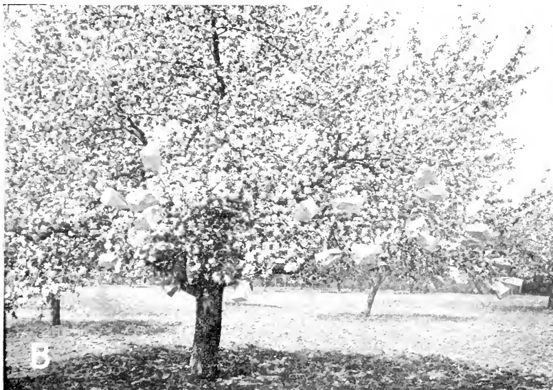
BREEDING A NEW APPLE

Seneca is so remarkable in one character at least, earliness, that it is bound to be a great acquisition to cherry growing. Its fruits ripen in the first weeks of June, more than 2 weeks earlier than Black Tartarian, the standard early cherry. The cherries resemble those of Black Tartarian in being large, round-cordate, purple-black, with juicy, melting flesh, and a rich, sweet flavor. The pit is free and the skin does not crack. The tree is very vigorous, productive, and has an upright-spreading growth. Seneca is one of the Station's most notable additions to varieties of hardy fruits.