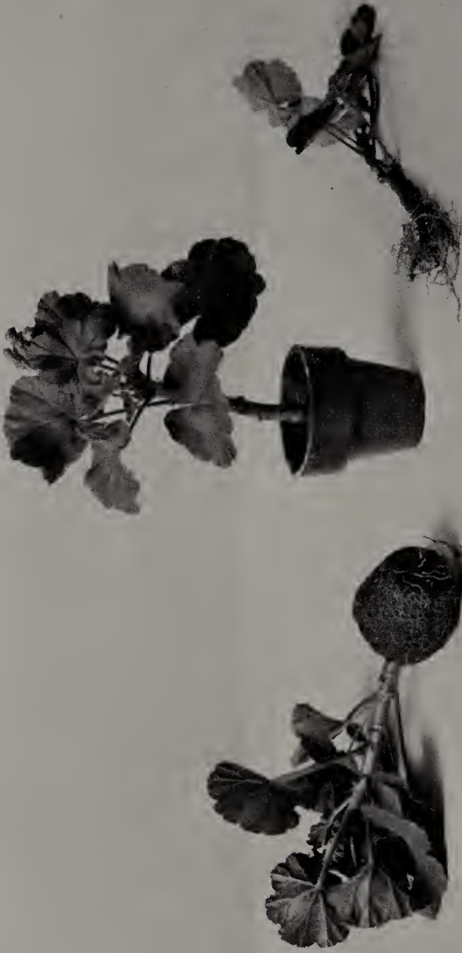
A typical 2¼" Geranium plant from among the "Aristocrats," and a rooted cutting from our greenhouses.