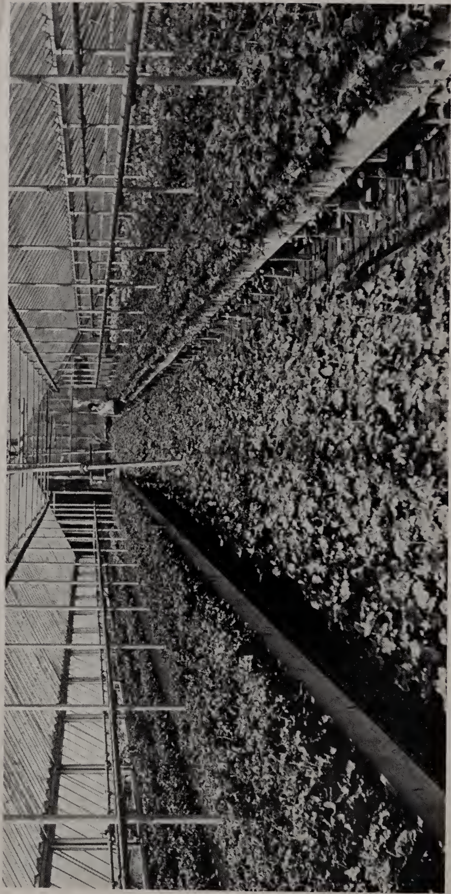
A house 125' x 28' of stock "Aristocrats," showing how we treat the humble geranium. They are given the same attention plus light and air that the modern rose or carnation gets. It makes for quality at no extra cost to you.