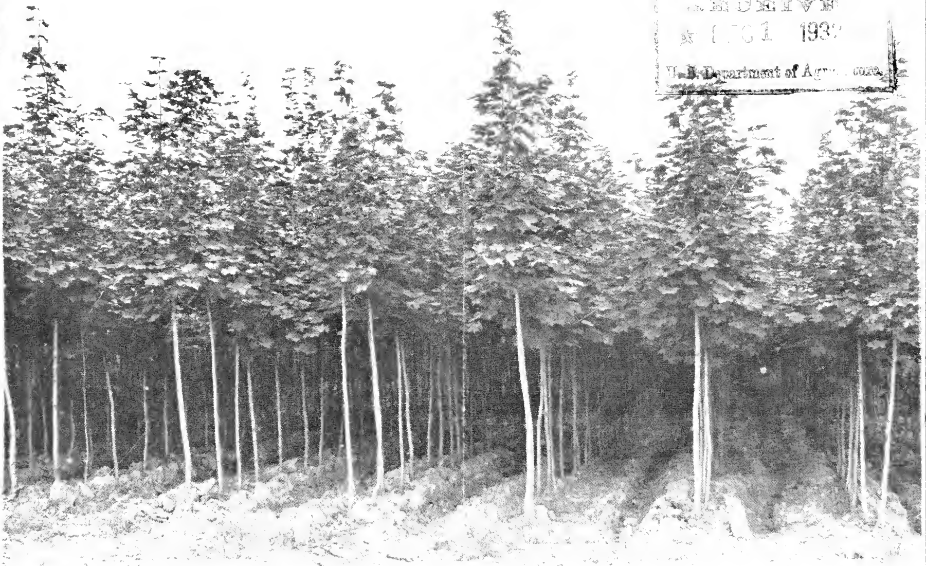
A NORWAY MAPLE BLOCK

U. S. DEPARTMENT OF AGRICULTURE BUREAU OF PLANT INDUSTRY WASHINGTON, D. C. 1931 U. S. Department of Agriculture