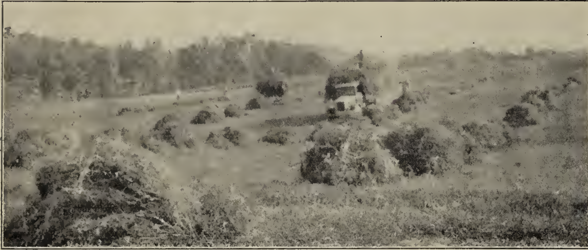
A Fine Crop of Korean Lespedeza Grown in North Carolina