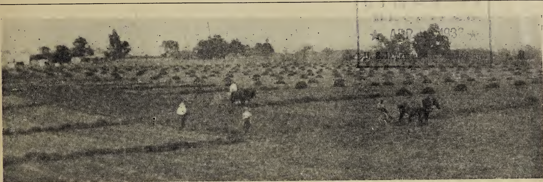
A FINE CROP OF VIRGINIA NORTHERN NECK RED CLOVER. THE MOST DISEASE RESISTANT STRAIN AVAILABLE.