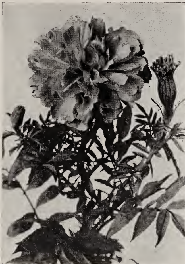
Guinea Gold Marigold

MARIGOLD, Guinea Gold. Large, loose-petalled orange flowers, resembling carnations, beautiful and lasting when cut; plants grow two feet high. Pkts., 15c.