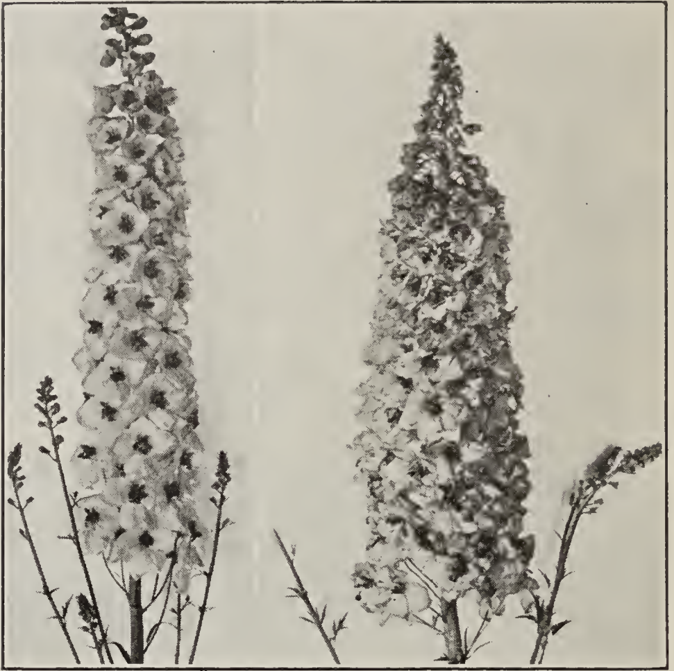
Campbell's Delphinium XXX Hybrid and Wrexham Types

White, pink, yellow, and purple, large, showy flowers on handsome specimen plants, in bloom all summer; 3 feet; sow February to May. Germ. per. 15 to 20 days. Mixed. Pkt. 10c.