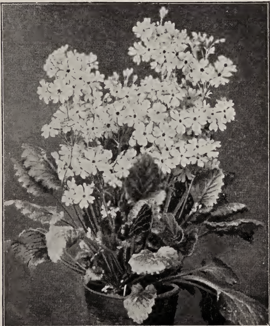
Primula Malacoides, True Rose

Malacoides (Baby Primrose; feathery clusters of small flowers for winter and spring beds and edgings; 1 foot; sow May to October): Deep Lilac; Light