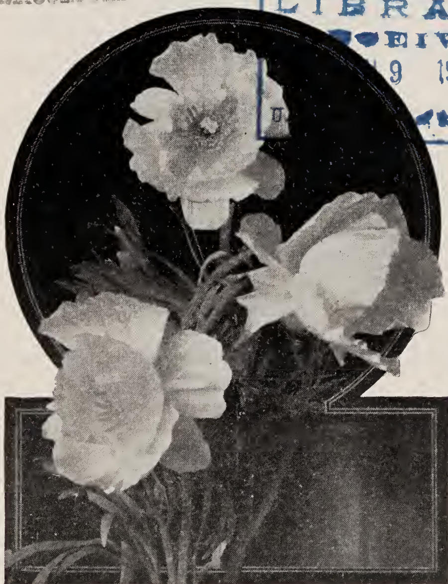
Hunnemannia, Sunlite See Novelties, page 4.