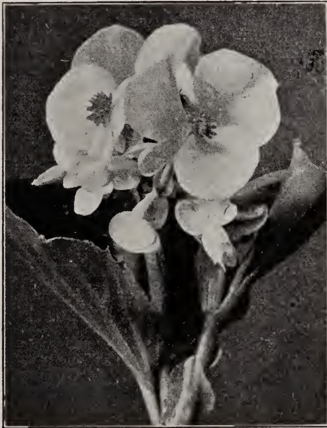
Fibrous-rooted Begonia, Prima Donna

Golden yellow, large, with many stamens; Calif. native, for sun and dry soil; 2 feet; sow December to April. Pkts., 10c.