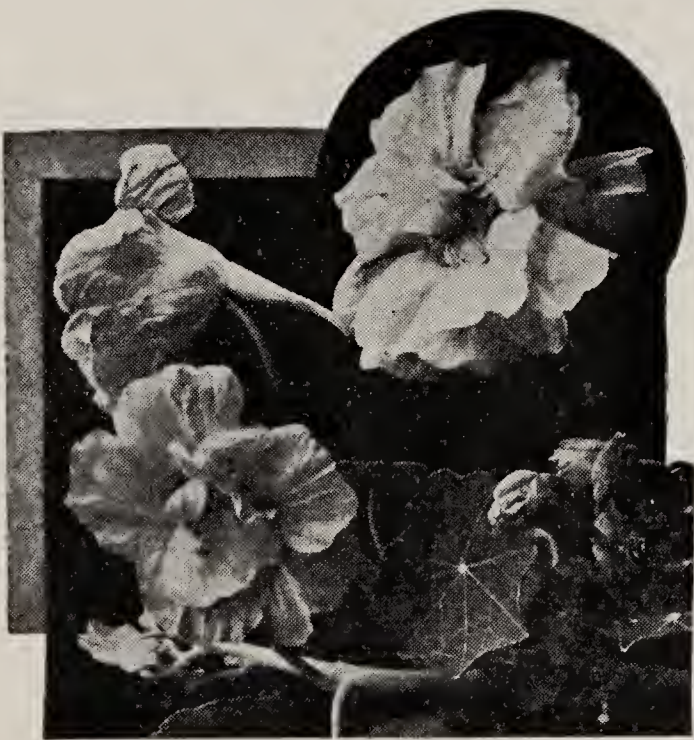
Nasturtium, Double Golden Gleam

CALENDULA, Chrysantha or Sunshine , a strikingly different, long-stemmed cutting and garden flower, the petals of the large buttercup yellow blooms being wide and loosely-placed so that they greatly resemble chrysanthemums. Pkts., 15c.