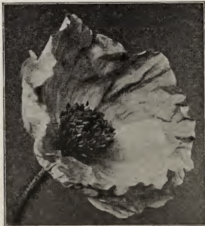
Iceland Poppy See perennial poppies, page 25.

Rose, red, yellow, purple, and white large, rich, velvety flowers, mostly veined with gold, for a striking bed or bouquet; 2½ feet; sow February to June. Germinating period 5 to 10 days. Emperor: Blue and Gold, Brown and Gold, Crimson, Rose and Gold, Violet and Gold, All Colors Mixed. Pkts., 10c.