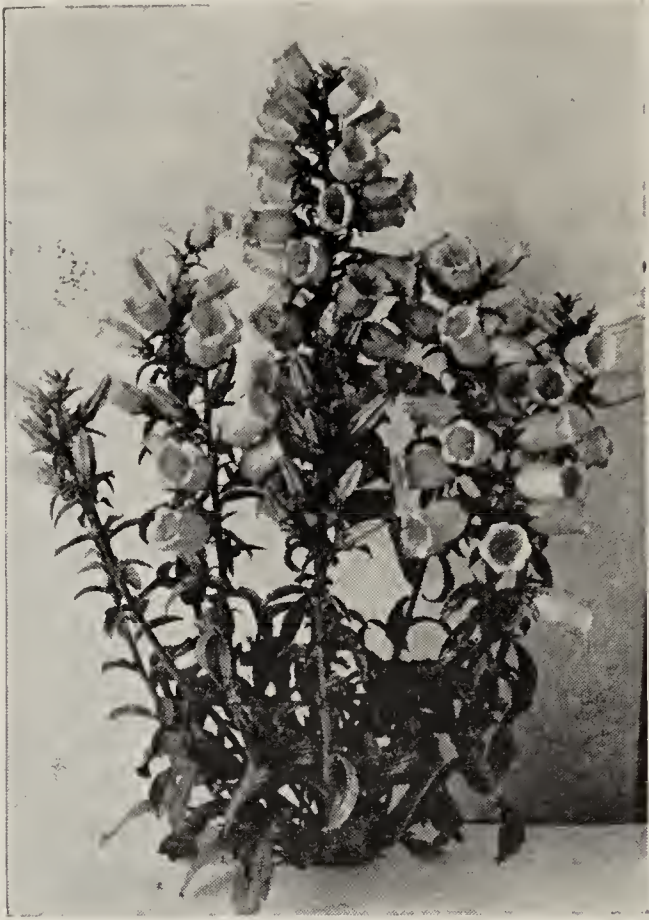
Annual Canterbury Bells

CANTERBURY BELL , New Annual, blooms in six months (seed sown in January blooms by June), plants two feet tall, with six to eight spikes of large, single bell-flowers, in light and dark blue, pink, rose and white. Mixed. Pkts., 25c.