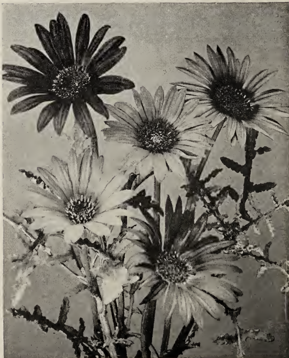
New Arctotis Hybrids See page 7.

Among the newer flowers which are particularly happy in Southern California are the various daisies from South Africa. Try the showy annual Venidi-ums (above), the perennial Arctotis Hybrids (below), the Dimorphothecas (page 15), as well as the splendid cutting Transvaal Daisy, or Gerbera (page 16.) Heliophila is a new blue South African annual. (See page 18).