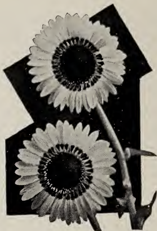
Venidium Fastuosum See page 29.