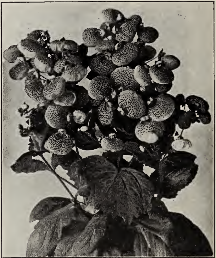
Calceolaria Hybrid Grandiflora

Crimson-violet, small flowers on trailing plant for sunny summer rockery or ground-cover; 6 inches high; sow March to May. Pkt., 5c.