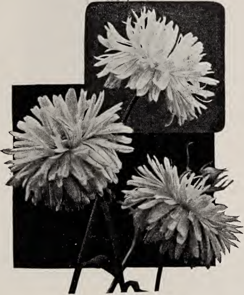
Calendula Chrysantha, or Sunshine

ASTER, Super Giant Los Angeles , is a greatly improved California Giant type, with enormous, fully-double, long- and curly-petalled flowers, on strong, tall stems; grows three feet high. Shell Pink. Pkt., 25c.