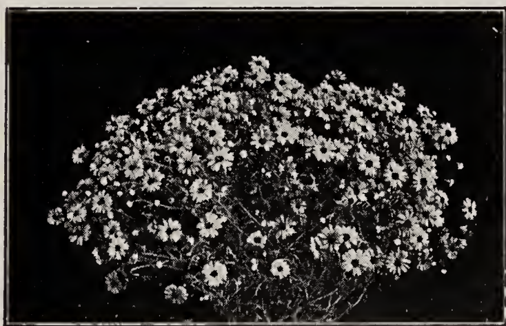
Brachycome or Swan River Daisy

Blue shades Orange and scarlet shades Rose Queen, rose shades Mrs. Scott Elliotts Imp. Mixed. W. F. Hybrids Mixed. Pkts., 15c.