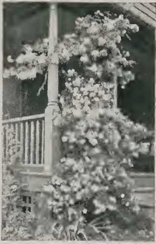
Paul's Scarlet Climber