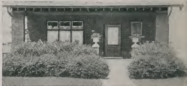
Barberry (front) and Mock Orange (rear).