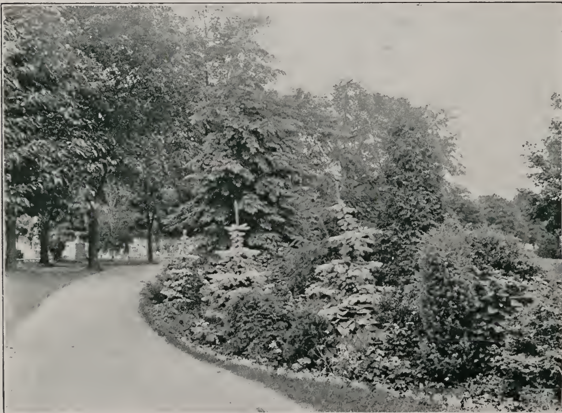
Beautifying a Drive

Perennials are best planted with trowel or hand spade. Remove badly injured or dried leaves. Trim long straggling roots, or bruised or damaged part. Plant so that roots spread out naturally. Plants with crowns should be set just below the surface of the ground.