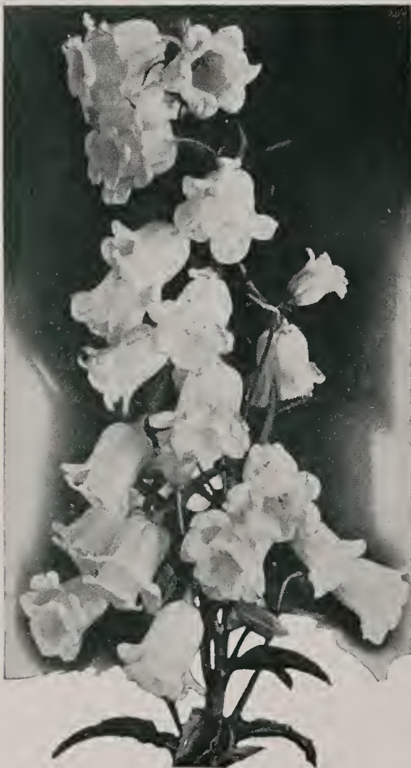
Campanula Canterbury Bells

AQUILEGIA (Columbine)—Pink, 2 ft., May-June.