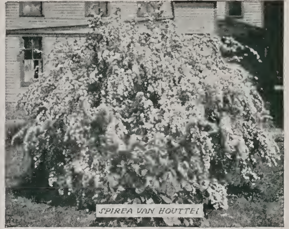
SPIREA VAN HOUTTEI