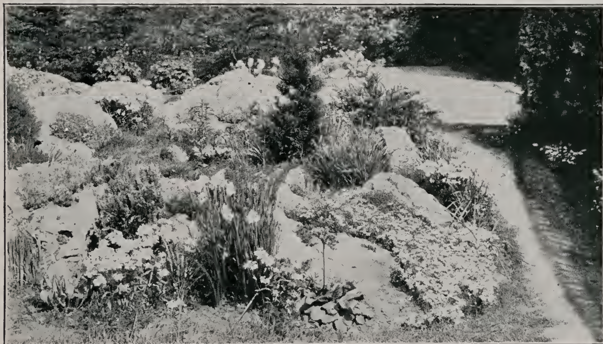
Many Perennials Are Adapted to the Rock Garden

Every home should have a rock garden. It is the most interesting of all flower gardens. The perennials listed on pages 10, 11, 12 and 13 and marked with a star are especially suited to rock gardens.