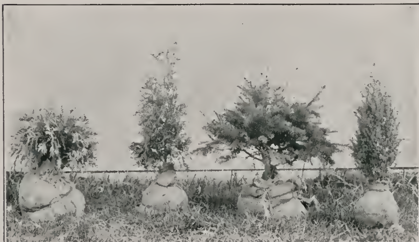
Balled and Burlapped—Ready to Ship