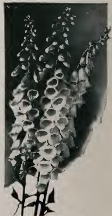
Digitalis or Foxglove

Medium (Canterbury Bells) — Assorted, 2 ft., June.