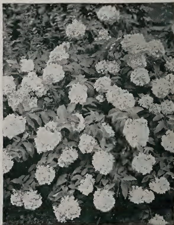
Hydrangea P. G.