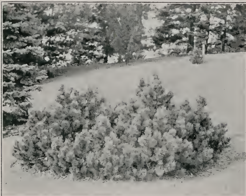
Spreading Type of Mugho Pine