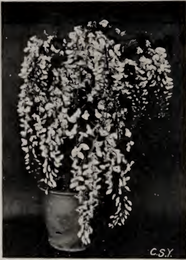
Wistaria Chinensis, grafted vines bloom.

WISTARIA CHINENSIS—Purple. This is the best known variety of all. Quite common but good.