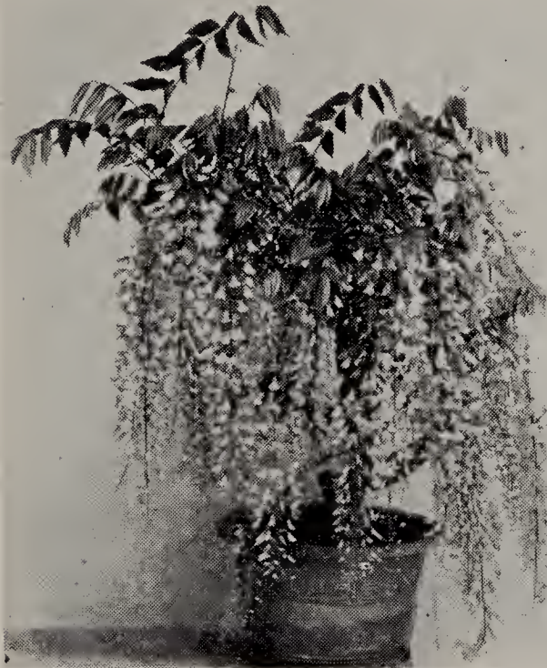
Wistaria Floribunda Rosea, a pot-grown vine 6 years old.