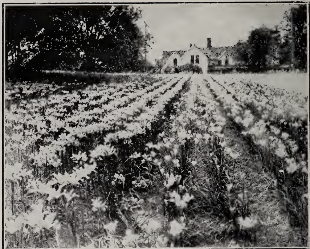
A FIELD OF OUR BULBOUS IRIS IN FLOWER