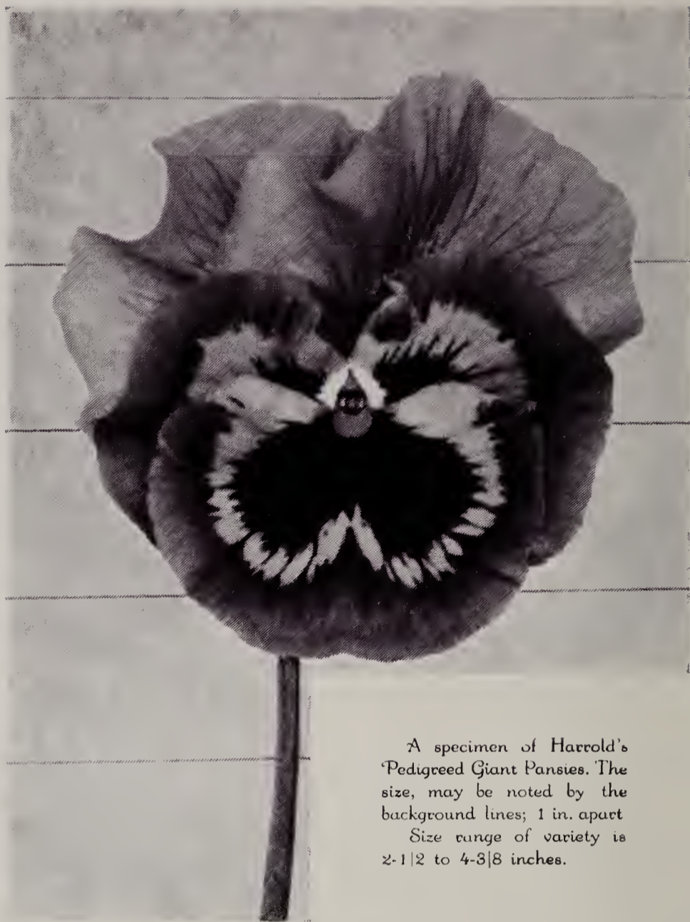
A specimen of Harrold's 'Pedigreed Giant Pansies. The size, may be noted by the background lines; 1 in. apart Size range of variety is 2-1/2 to 4-3/8 inches.