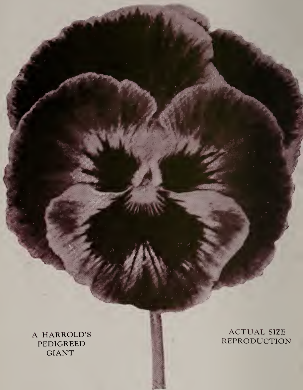
A HARROLD'S PEDIGREED GIANT