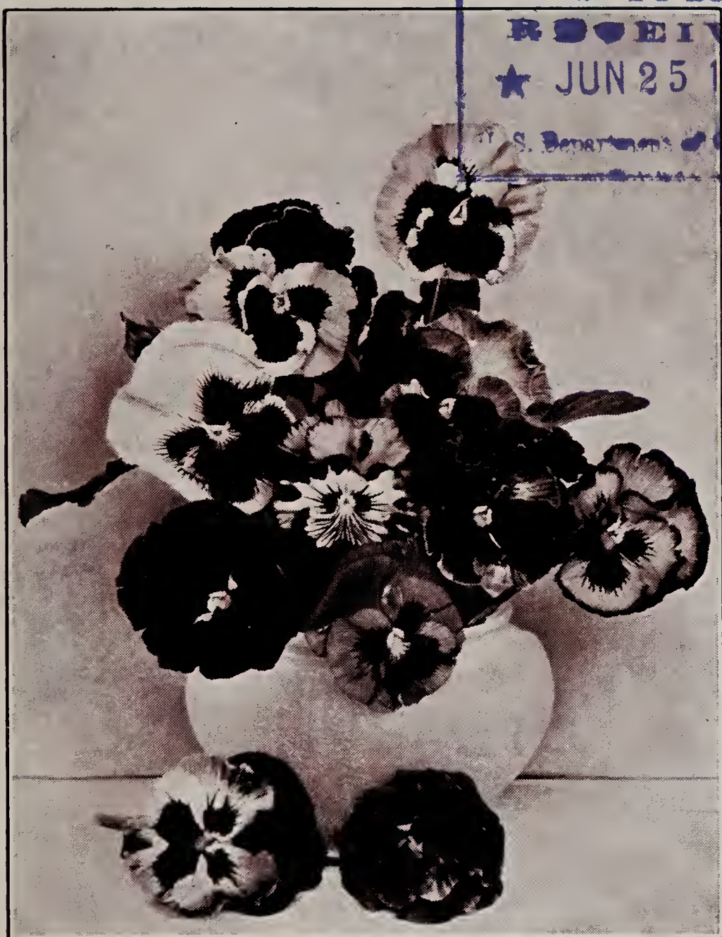
A BOUQUET OF HARROLD'S PEDIGREED GIANTS - - 1934 Other illustrations page 7 and back cover; description page 8.

LIBRARY RECEIVED ★ JUN 25 1934 ★ U. S. Department of Agriculture