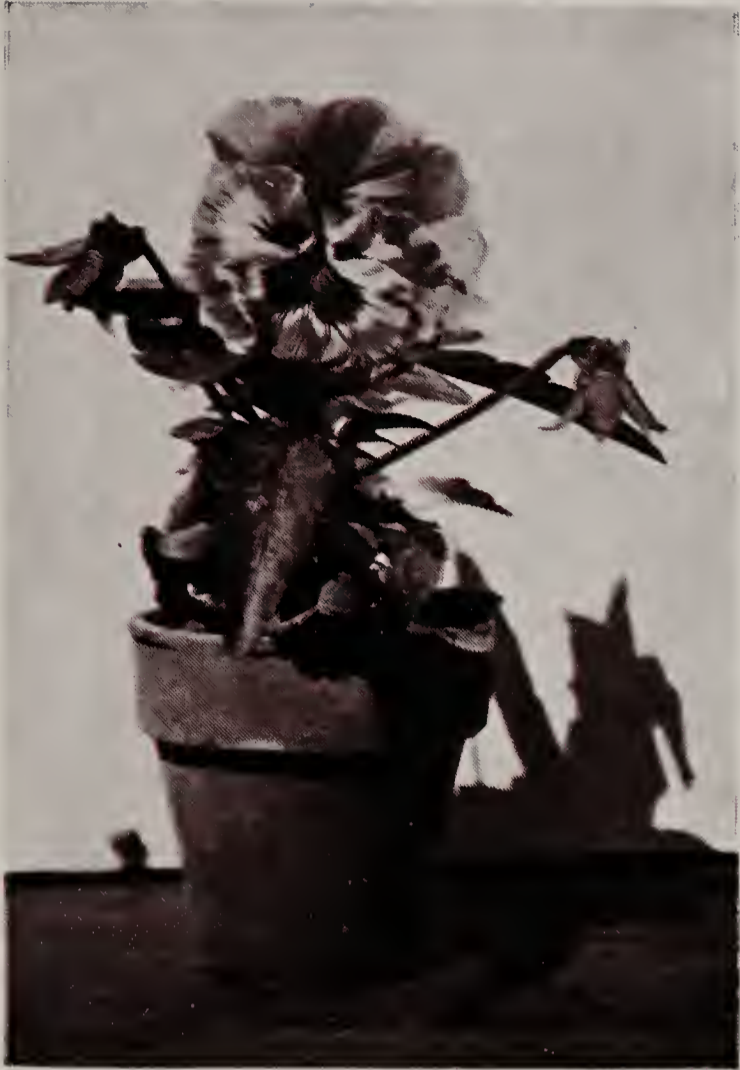
A HARROLD'S PEDIGREED POT PANSY