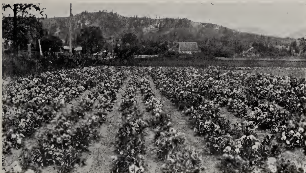
ONE OF OUR PANSY FIELDS PHOTOGRAPHED IN MAY

We shall endeavor to merit your continued confidence and patronage, and shall welcome any opportunity that you may afford us to be of service. We also thank many of you for your valued support in the past and trust we may look forward to, and merit your future patronage.