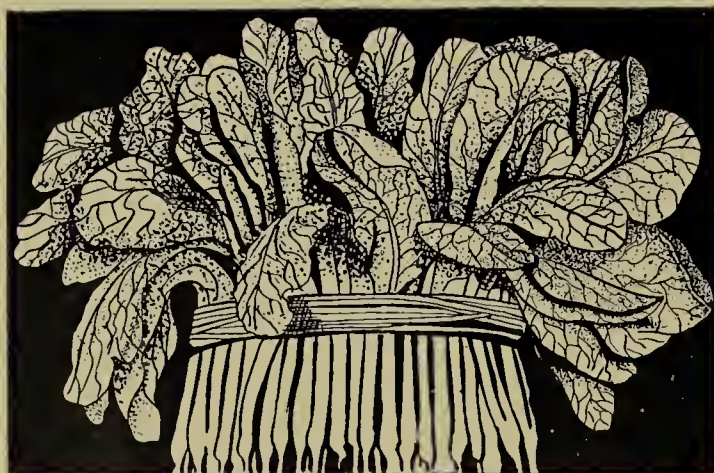
MUSTARD SPINACH, TENDERGREEN

Today one of the most popular Mustards in the South. Its use is rapidly growing in the northern States for spring and midsummer planting..... 22c