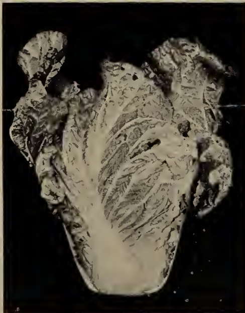
Celery Cabbage Sakata's Market Pride