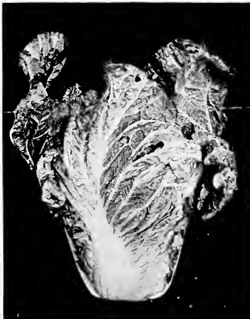
Celery Cabbage Sakata's Market Pride