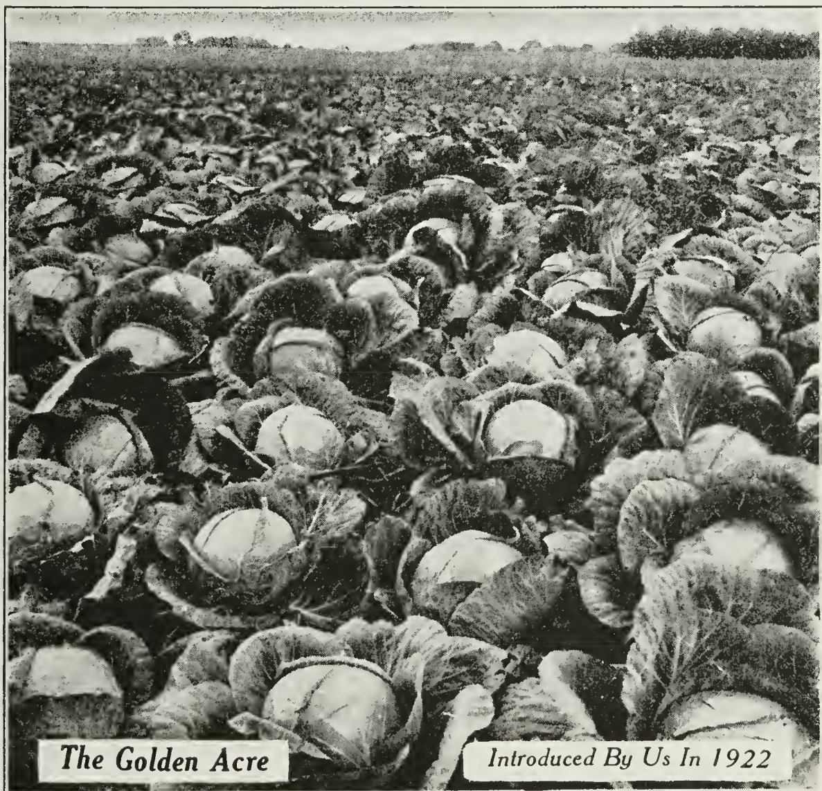
The Golden Acre