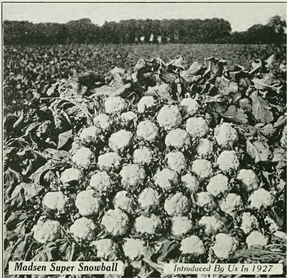
Madsen Super Snowball