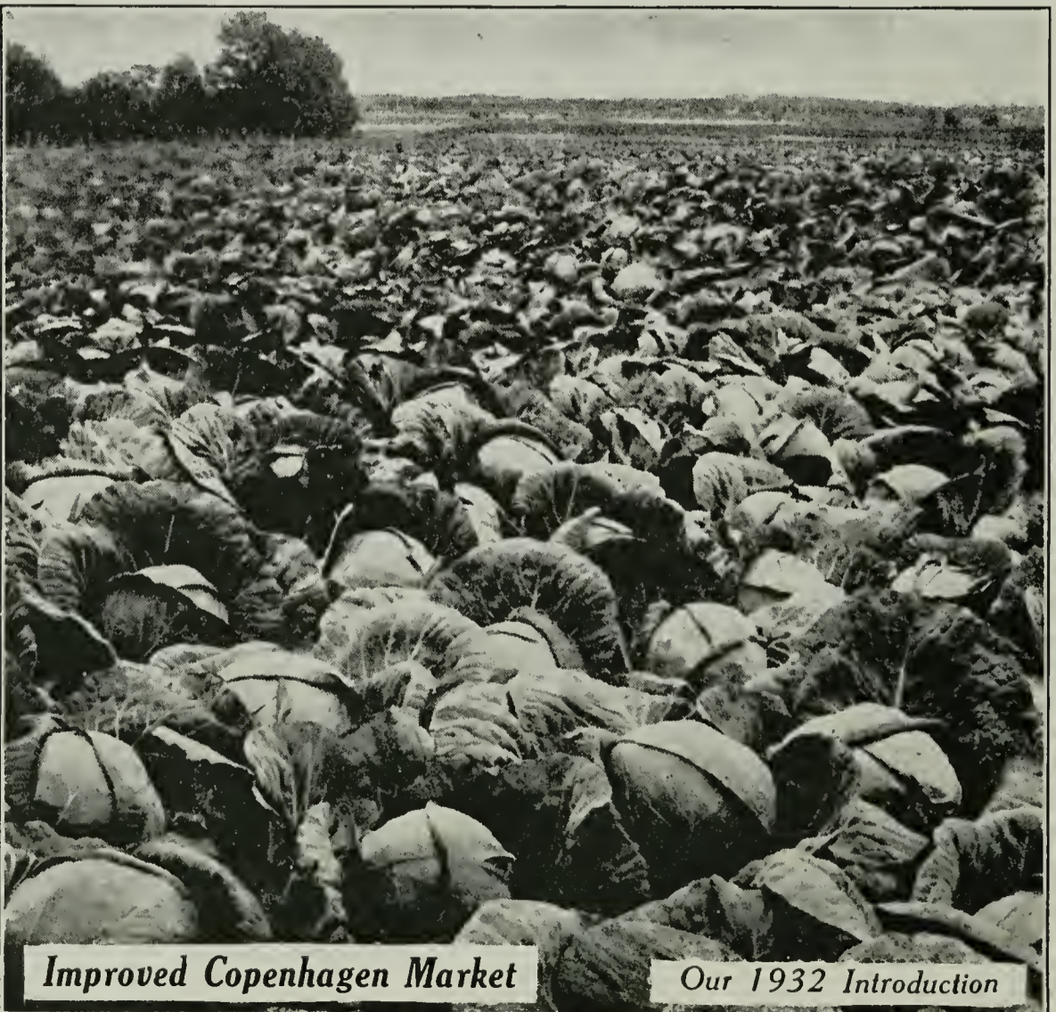
Improved Copenhagen Market