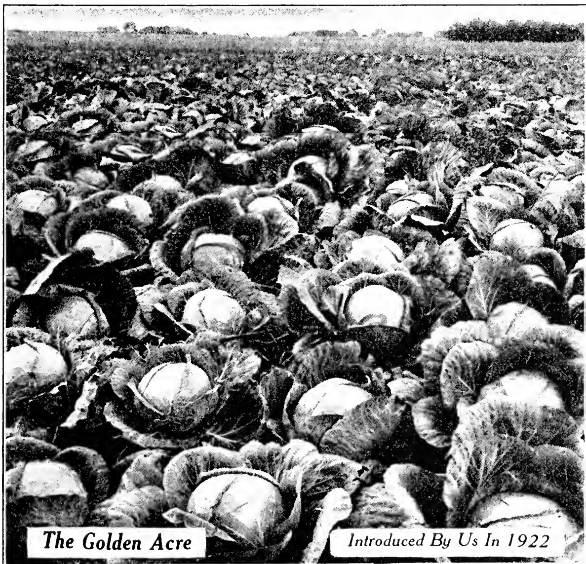
The Golden Acre