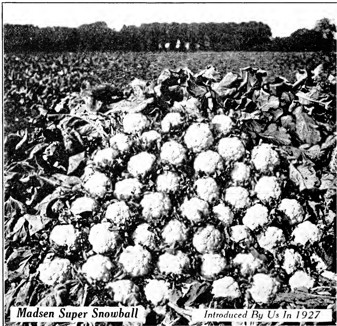
Madsen Super Snowball