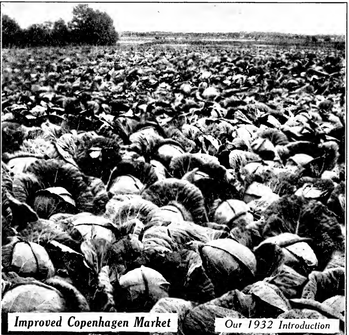
Improved Copenhagen Market