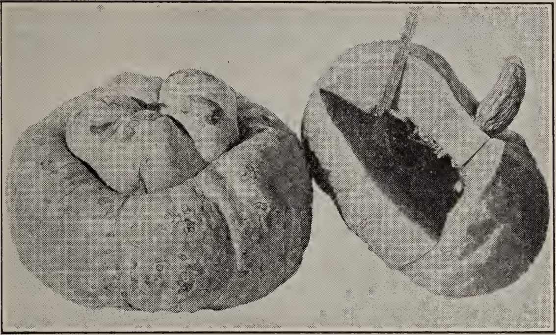
Cloud Peak Squash

have enough to last that long. Postpaid prices: Pkt. 5c; oz. 15c; \frac{1}{4} lb. 45c; 1 lb. $1.40.