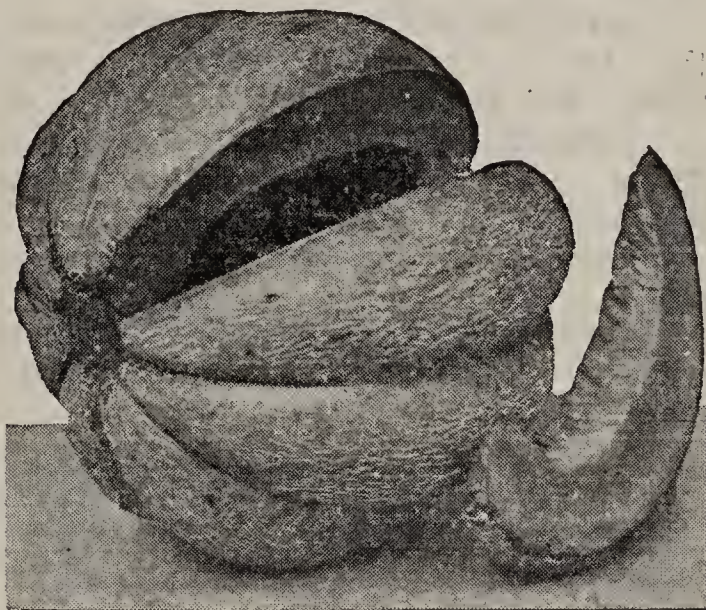
Extra Early Hackensack Muskmelon

HONEY DEW —Differs in appearance and flavor from all other melons. Smooth skin, with sweet, sugary flesh. Ripen after harvest and can be kept until Thanksgiving time. Postpaid prices: Pkt. 5c; 1 oz. 20c; \frac{1}{4} lb. 50c; 1 lb. $1.40.