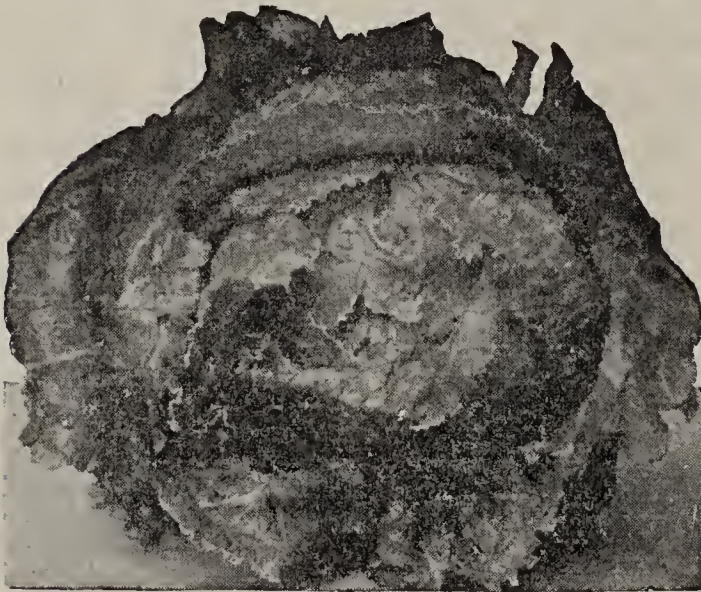
New York or Wonderful Head Lettuce

Postpaid prices on above varieties: Pkt. 5c; oz. 15c; \frac{1}{4} lb. 45c; 1 lb. $1.15. Not Postpaid: per lb. $1.10.