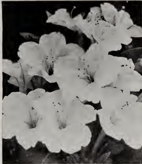
Marvel of Peru.