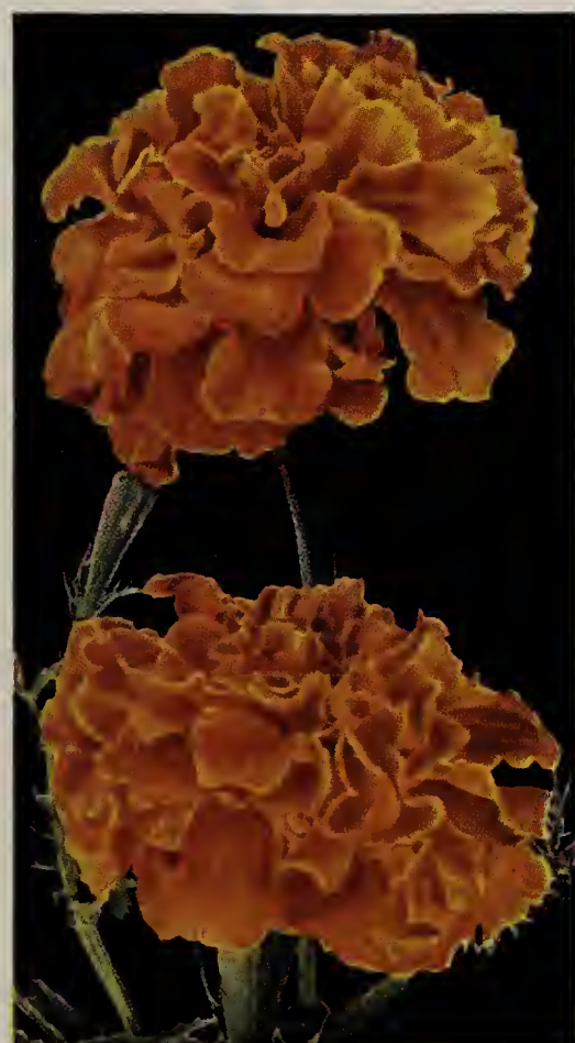
New Guinea Gold Marigold.

Carnation-like flowers, 100 per cent semi-double, 2½ inches in diameter. Color a brilliant orange flushed with gold. The usual Marigold odor is less pungent. The newest Marigold of merit. Pkt., 25c.