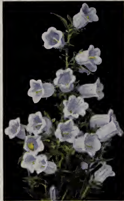
Annual Canterbury Bells.

An annual producing mammoth flowers that are a great improvement in size over the ordinary Scabiosa. Mixed shades. Pkt., 25c.