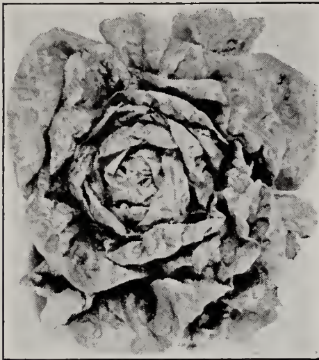
New York or Wonderful Lettuce.