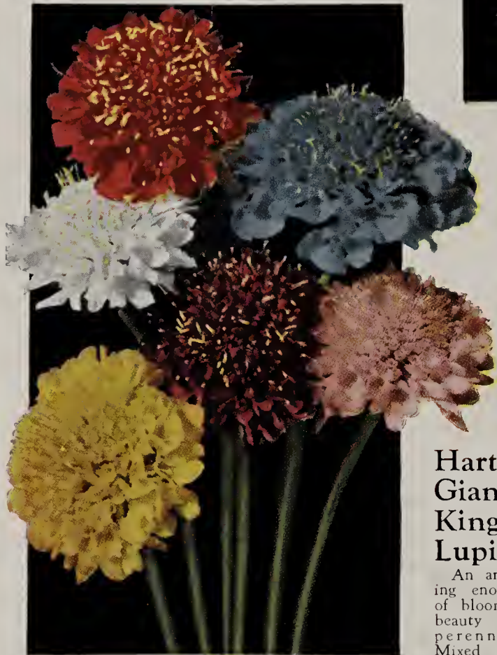
New Giant Hybrid Scabiosa.

Very ornamental annual growing 2 ft. high, producing beautiful large, bell-shaped flowers in shades of pink, blue and white continuously throughout the season. Mixed. Pkt., 25c.