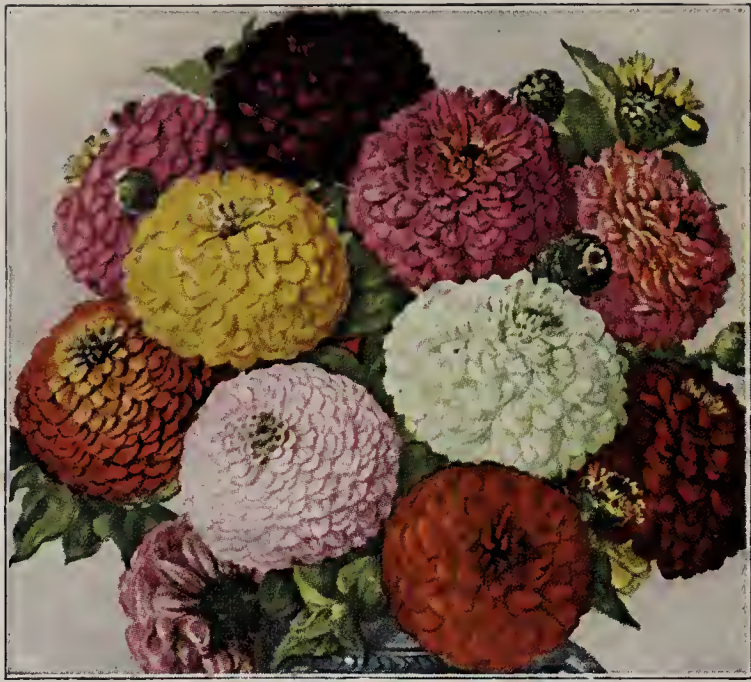
Giant Dahlia-Flowered Zinnias.