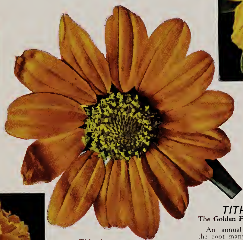
Tithonia, The Golden Flower of the Incas.

See page 9 for further description of both these novelties.