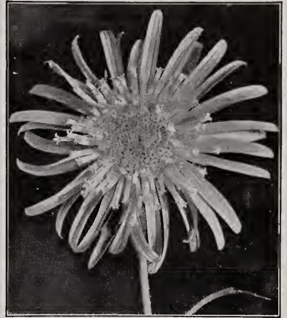
Giant California Sunshine Aster.