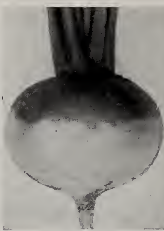
Globe Turnip, Purple Top White