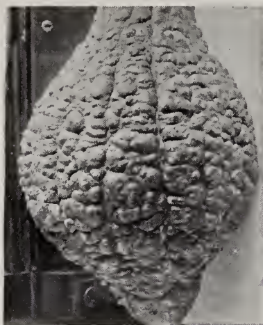
Lohrman's Hubbard Squash.