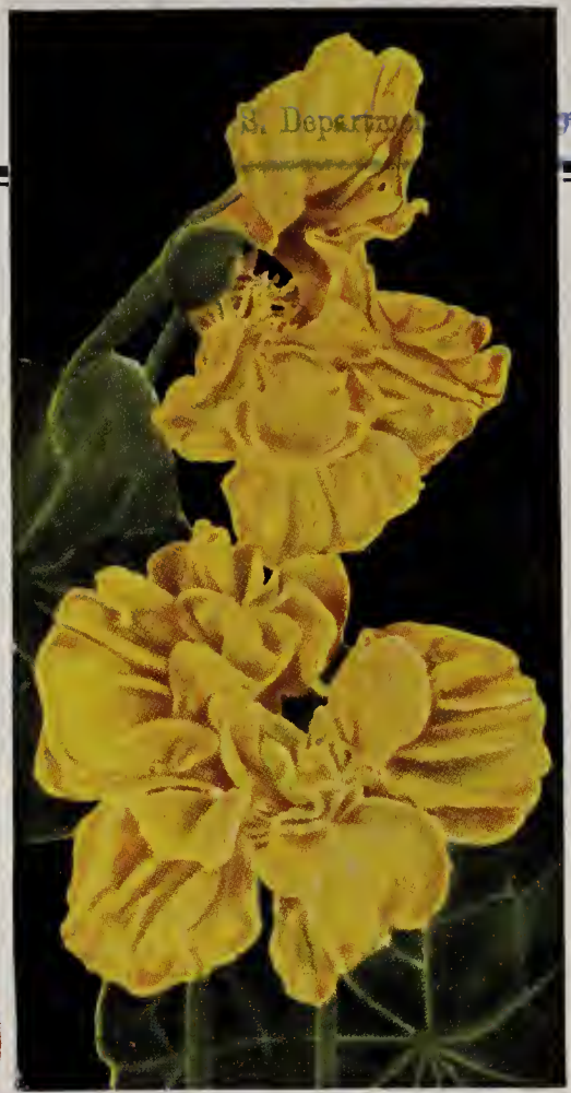
New Golden Gleam NASTURTIIUM

These new discoveries and developments in flowers are giving us fresh enjoyment in new types of flowers for our gardens. These have been thoroughly tested and found successful in our climate.