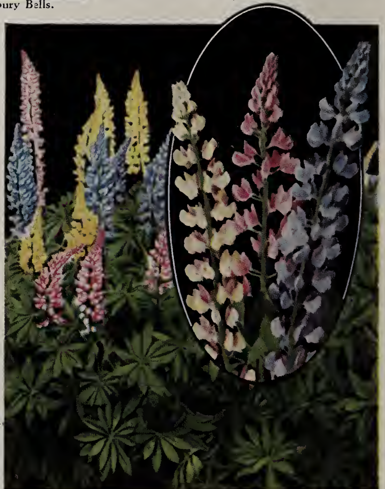
Hartwegi Giant Lupines.

An annual producing enormous spikes of bloom rivaling in beauty and size the perennial Lupine. Mixed colors. Pkt., 25c.