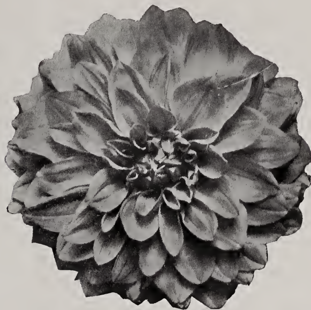
Dwight W. Morrow.

RAFFIA Natural, 50c; green, $1.00, per lb. We carry a complete line of Plant Stakes, Plant Tubs, Lawn Sprinklers, Shears, Garden Tools, Watering Cans and Easy Garden Gloves, etc.