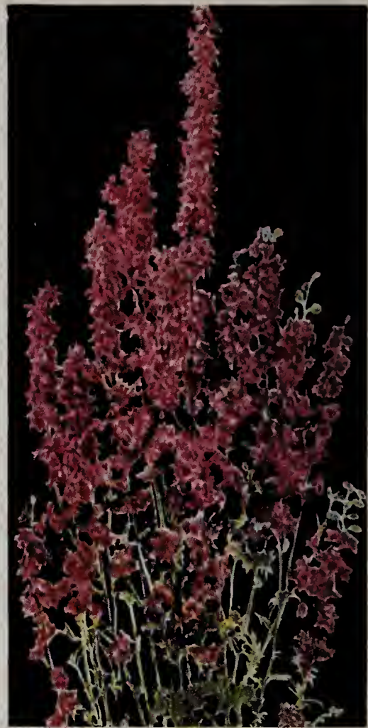
Giant Imperial Larkspur.