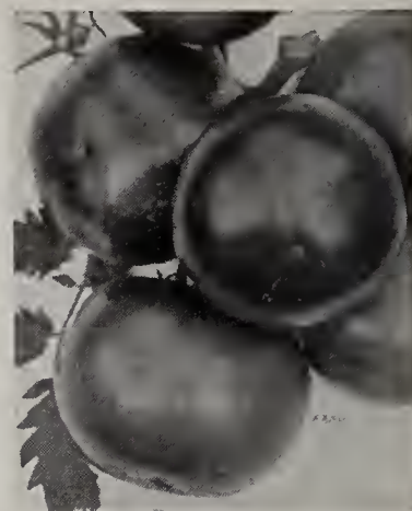
Bonny Best Tomatoes.

SPINACH One ounce will sow 100 feet of row; 15 pounds will sow an acre in rows; 25 pounds if broadcast. Sow from spring until fall, 1 inch deep and 1 foot in rows. Not less than 10 lbs. at 100-lb. rate.