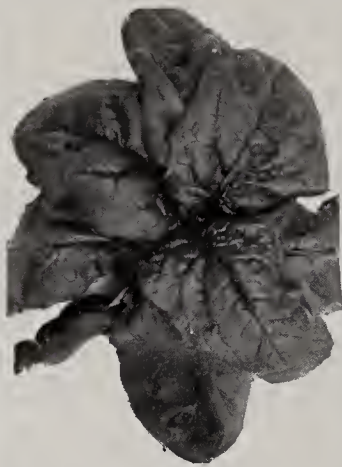
Bloomsdale Long Standing Savoy Spinach.