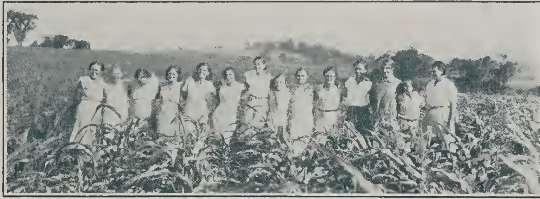
Interested and Interesting. One of the Detasseling Crews at Quaker Hill Farm