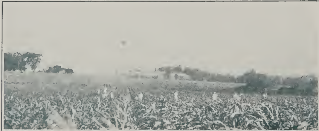
Detasseling to Make Golden Cross Bantam

"In trials conducted for three years at LaFayette, Ind, this hybrid (Golden Cross Bantam) produced on the average, 3.84 tons of green corn per acre as compared with 2.49 tons of green corn per acre obtained from the highest yielding open-pollinated