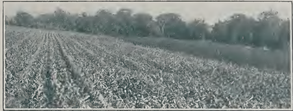
Crossing Purdue Bantam and Golden Bantam

During the period of its development, Golden Cross Bantam has occasionally been compared with larger-eared and later-maturing yellow varieties, such as Whipple Yellow, Bantam Evergreen, and Golden Evergreen, and has been consistently superior to them in yield. In co-operative trials in the various States this hybrid has uniformly produced more green corn than have strains reaching the canning stage at comparable dates"