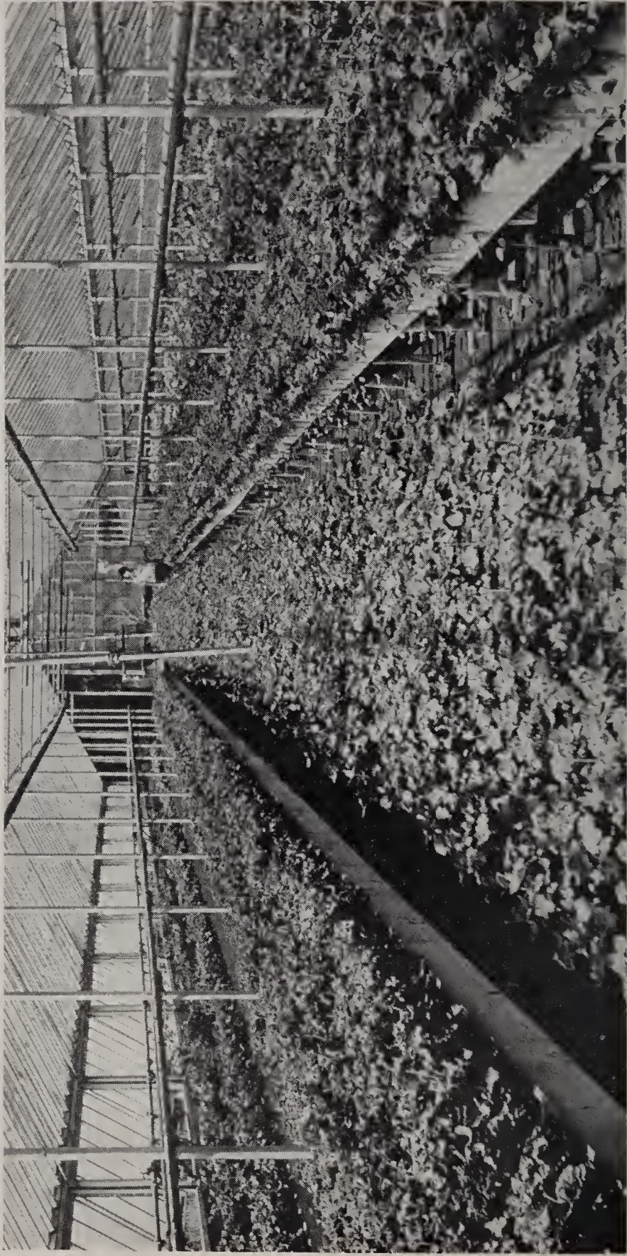
One of the many houses of stock "Aristocrats," 125' x 28', showing how we treat the humble geranium. They are given the same attention plus light and air that the modern rose or carnation gets. It makes for quality at no extra cost to you.