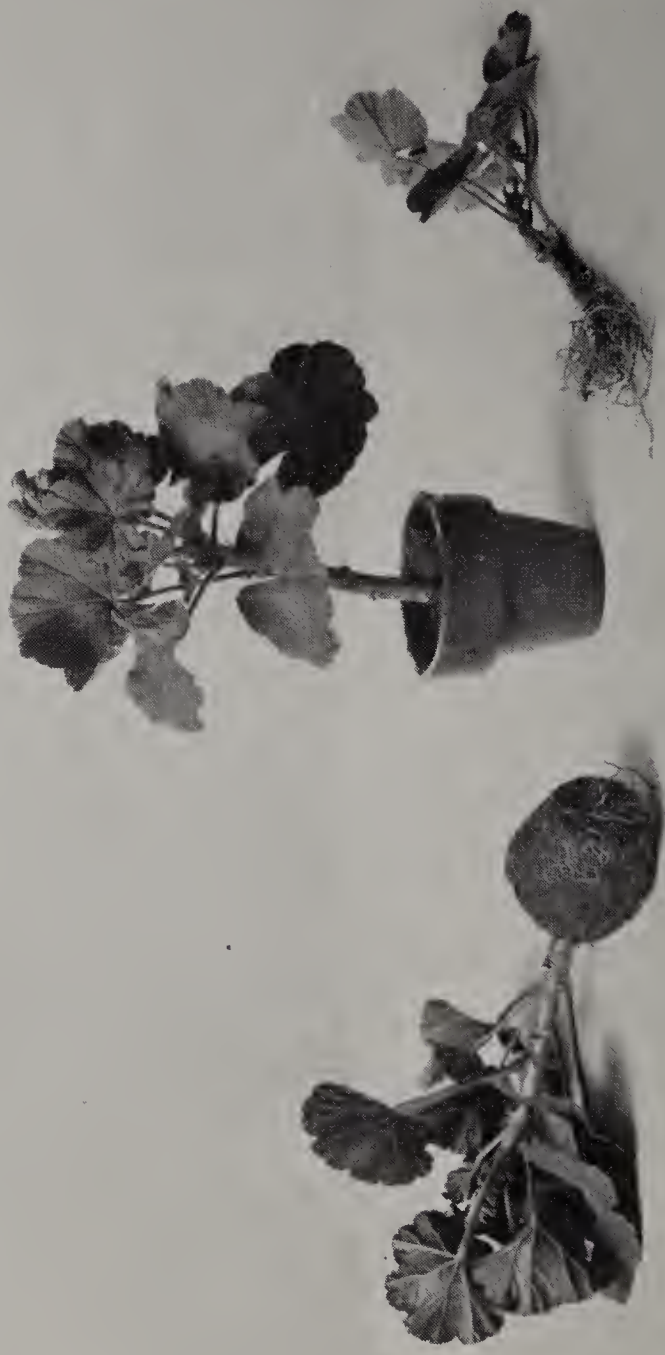
A typical 2¼" Geranium plant from among the "Aristocrats," and a rooted cutting from our greenhouses.