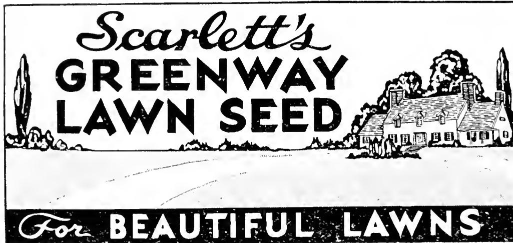
Window Display Streamer

Hundreds of dealers have increased their sales and profits by handling SCARLETT'S LAWN SEED. Although our prices are unusually reasonable the quality of our Lawn Seed is exceptionally high. Let us furnish you with the kind of Lawn Seed that will make satisfied customers and more profit for you.