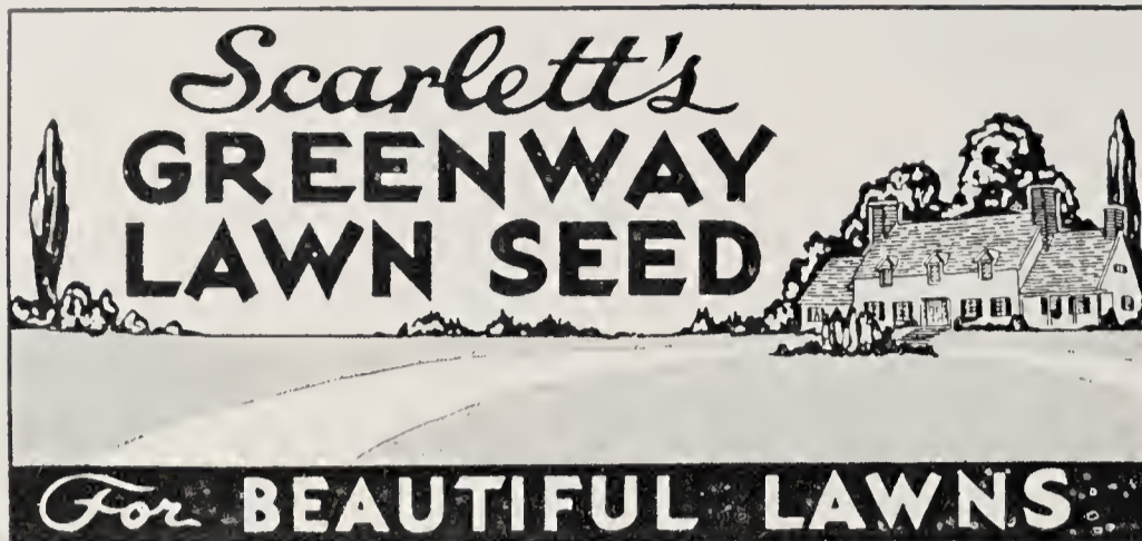
Window Display Streamer