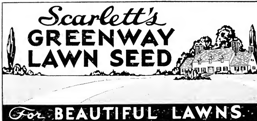
Window Display Streamer