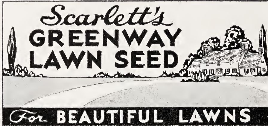
Window Display Streamer