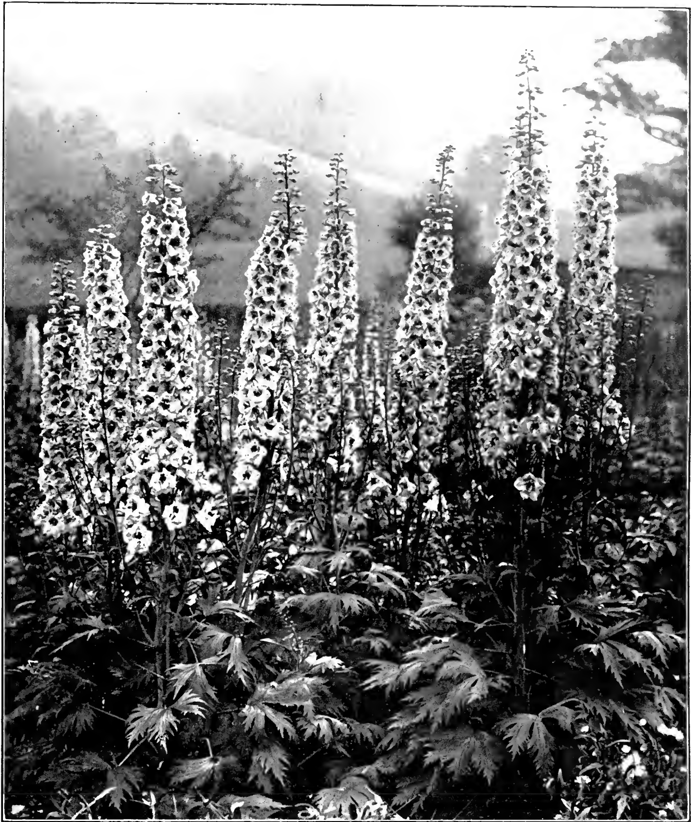
Watkin Samuel's "Hollyhock-Flowered" Delphiniums.