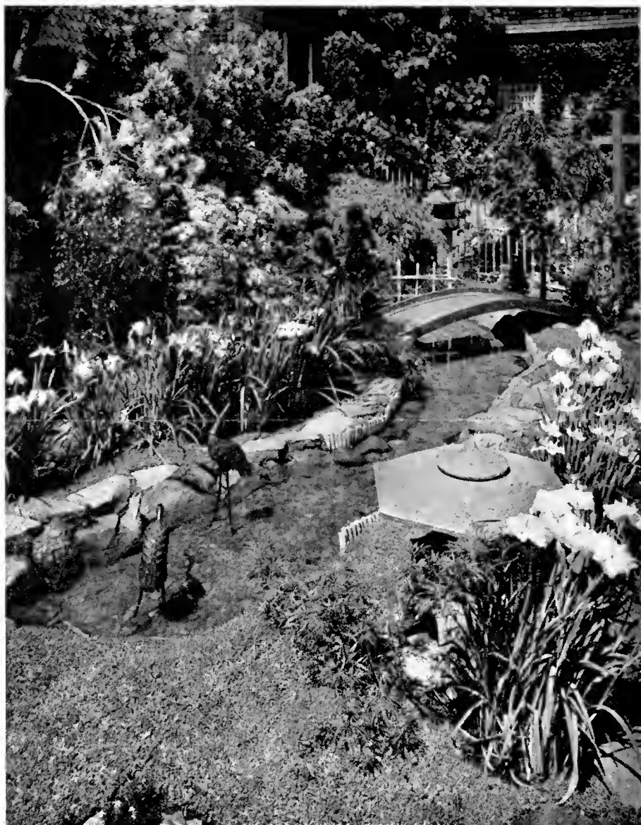
View of our Prizewinning Japanese Iris Garden at the 1934 Newport, Rhode Island, Summer Show.

These varieties have never been offered before. They were selected as the choicest from a fine collection in the most famous private Japanese Iris Garden in Yokohama. All were named by us in honor of prominent flower lovers during the Summer Show in Newport, Rhode Island, where they were exhibited. Japanese Irises are best planted during August-September.