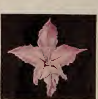
$1.20 for 10 The Orchid $9.50 per 100