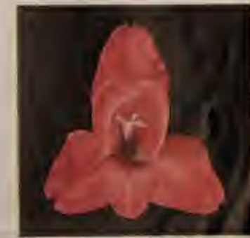
$1.25 for 10 Mrs. S. A. Errey $10.00 per 100