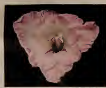
$0.80 for 10 Annie Laurie $5.50 per 100