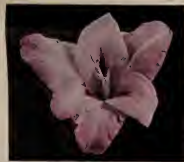
$1.00 for 10 Mrs. Van Konyenburg $7.50 per 100