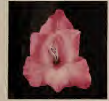
$4.75 for 10 Schwabengirl $45.00 per 100