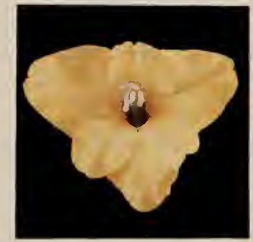
$2.75 for 10 Canberra $25.00 per 100