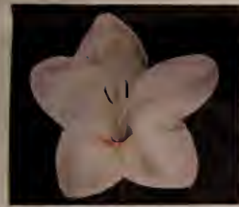
$1.15 for 10 Idamao $9.00 per 100