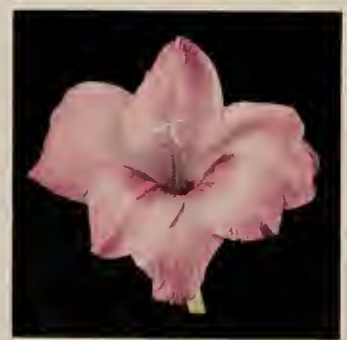
$1.10 for 10 Marmora $8.50 per 100