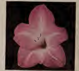
$1.25 for 10 Jane Addams $10.00 per 100

Regular list price $1.93 Special price $3.25