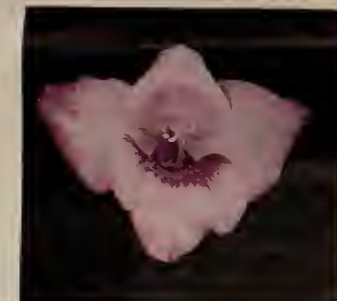
$1.05 for 10 Muriel $8.00 per 100