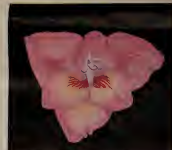
$0.75 for 10 Orange Queen $5.00 per 100