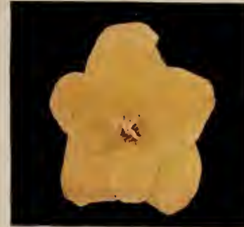
$0.70 for 10 Golden Measure $4.50 per 100