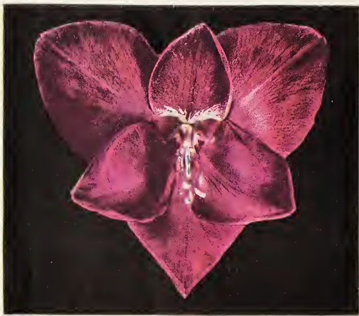
$0.85 for 10 Persia $6.00 per 100