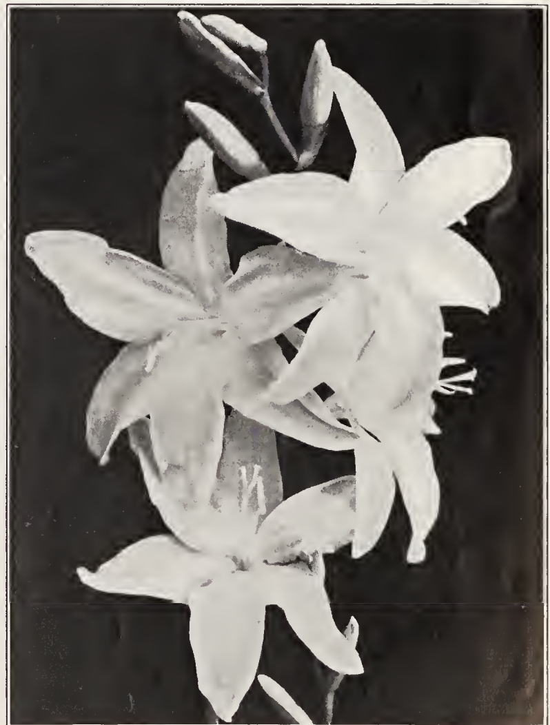
Montbretia "Star of the East"

STAR OF THE EAST. First Class Certificate; Award of Merit. One of the finest Montbretias ever raised; flowers pale orange yellow, with lemon-yellow eye, expanding quite flat and held erect. The flowers are much larger than any other variety in this class, best blooms measuring 5 inches in diameter. The size, vigor, color and habit are magnificent and unequalled. 10 corms, $4; 100 corms, $32.50.