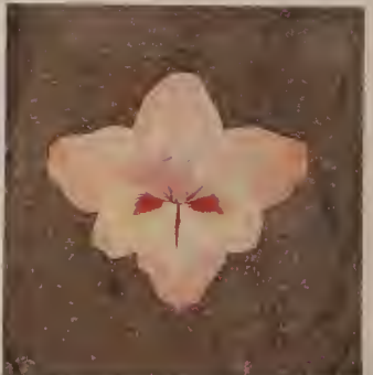
$0.80 for 10 Sunnymede $5.50 per 100