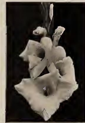
$2.75 for 10 Mammoth White $25.00 per 100

As its name implies, this is one of the largest flowered Gladioli; the blossoms often measure 7 inches in diameter and are carried on tall, straight spikes. The pure white florets are well placed with many open at one time.