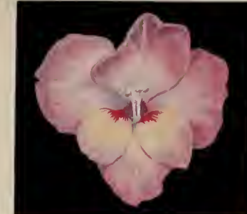
$0.75 for 10 Mrs. F. C. Peters $5.00 per 100