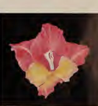
$1.10 for 10 Phaenomen $8.50 per 100