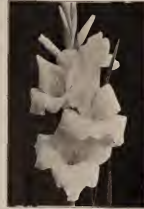
$1.75 for 10 Albatross $15.00 per 100

Regular price list $17.83 Special price $15.50