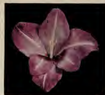
$1.15 for 10 Veilchenblau $9.00 per 100