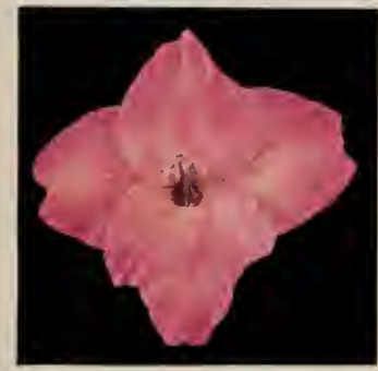
$4.25 for 10 Bagdad $40.00 per 100