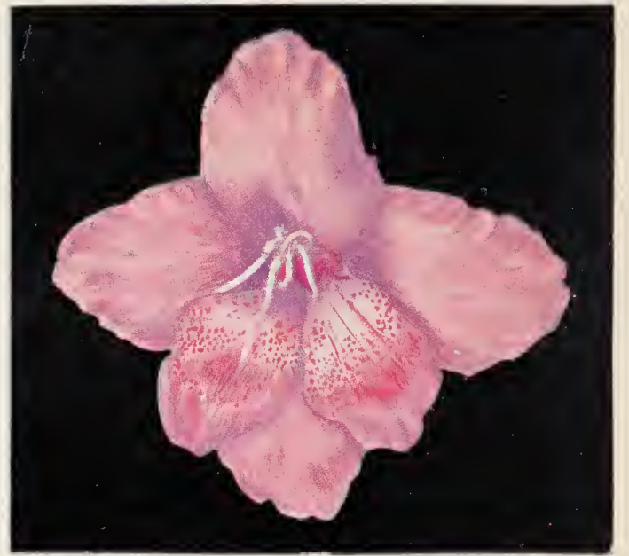
$1.05 for 10 Prince of India $8.50 per 100