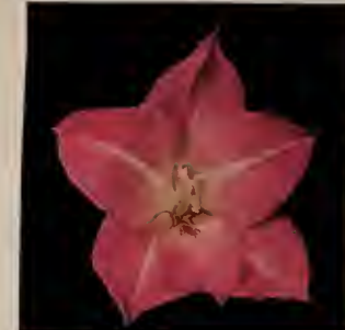
$0.90 for 10 Longfellow $6.50 per 100