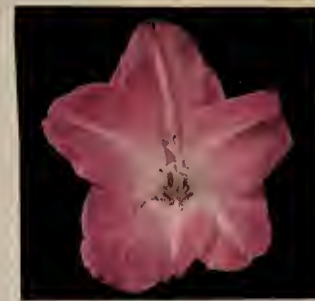
$1.00 for 10 Minuet $7.50 per 100