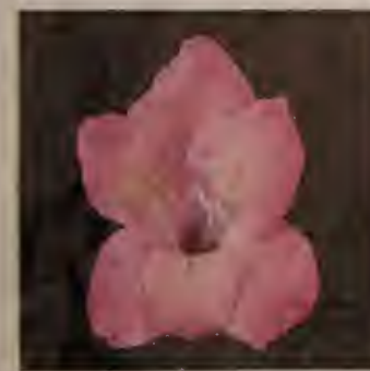
$2.00 for 10 Salbach's Pink $17.50 per 100