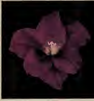
$7.75 for 10 Pelegrina $75.00 per 100