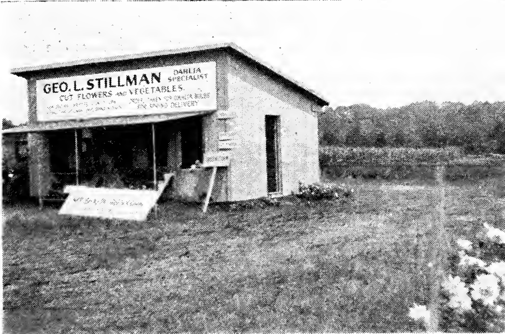
Roadside Stand at My Field on Watch Hill Road, Westerly, R. I.