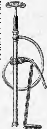
Bucket Spray Pump.

4-Foot Extension Pipe, for reaching into trees and inaccessible places, 50c. postpaid. By express, 40c.