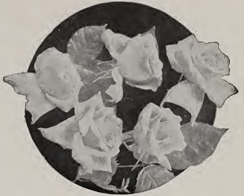
Kaiserin Auguste Viktoria, one of the most perfect in form

If budded roses had no advantage, there would be no difference of opinion. We prefer budded plants of most ever-bloomers and some of the hybrid perpetuals and climbers. They give more, better and larger flowers, and that's what we grow roses for. The only disadvantage, which we think is more than offset by their greater vigor and freedom of bloom, is that budded roses occasionally sprout from the roots. Such sprouts, which should be removed, have a different appearance with usually 7 to 9 leaflets to the stem, while most hybrid perpetuals and ever-blooming roses (except some yellow varieties) have 3 to 5, usually 5. When planted with the bud or joint just below the surface, roses as now budded seldom sprout.