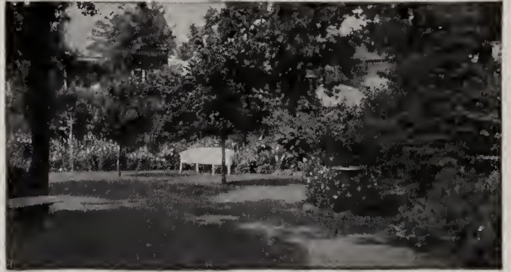
This illustrates an outdoor living room with its green carpet for the kiddies' feet, its sweet flowering blooms so refreshing to all and its friendly trees which throw a kindly shade.

There are some things, such as hardy perennials, the size of which can hardly be described. We tell you the size of most items. Yet every nurseryman knows that one grower's 3 to 4 ft. Shrubs, for example, may be larger and better branched than another's. You have to depend upon the reputation of the grower for that. One's reputation, after all, is more guarantee than anything he may say. A nurseryman supplies quality stock for two reasons—pride in his reputation and a desire to give the customer his money's worth. This Nursery takes pride in its reputation since 1875 for quality stock at fair prices. It's impossible for any nursery to furnish all varieties equally rooted or as heavily branched—they don't all grow that way. An Apple will be better rooted than a Cherry, a Spirea better branched than a Sumac, a Daisy larger than a Phlox. Some Roses will be larger than others. But we do promise you first class stock of