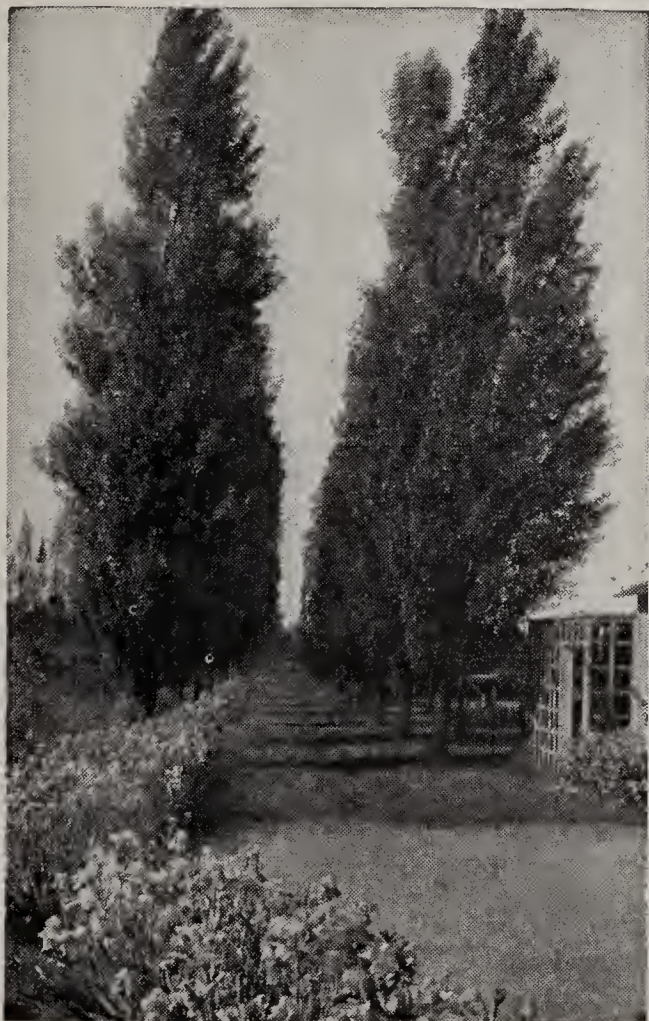
Lombardy Poplar, excellent as an accent tree and for screen plantings

5 to 6 feet, 2 year heads.....$1.25 each, 2 for $2.25