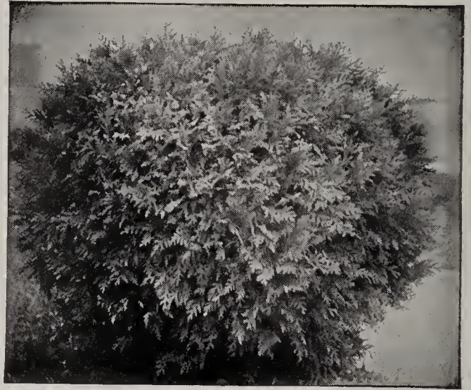
Globe Arborvitae is naturally globular in form