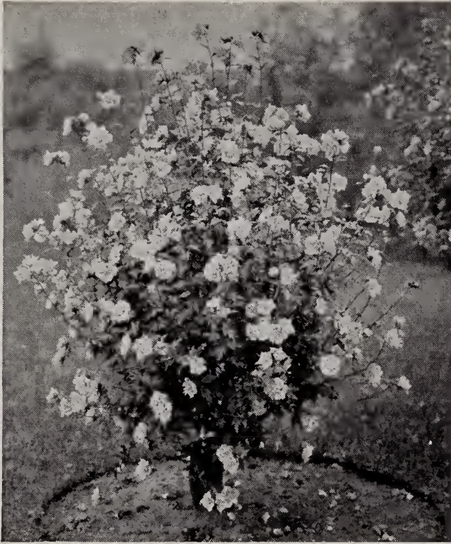
Althea blooms late in Summer