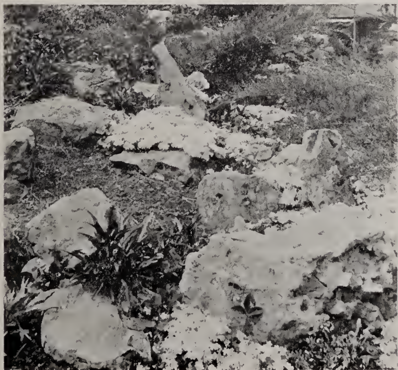
Phlox subulata at Sarcoxie Nurseries. One of the first brilliant color spots of spring.

Spreading heads of small feathery white flowers in summer,