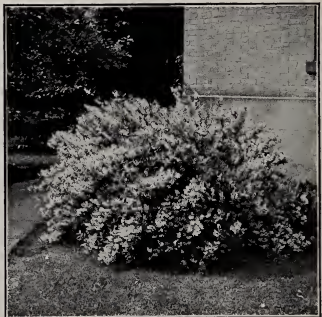
Deutzia gracilis, almost as dainty as Lily of the Valley, in May