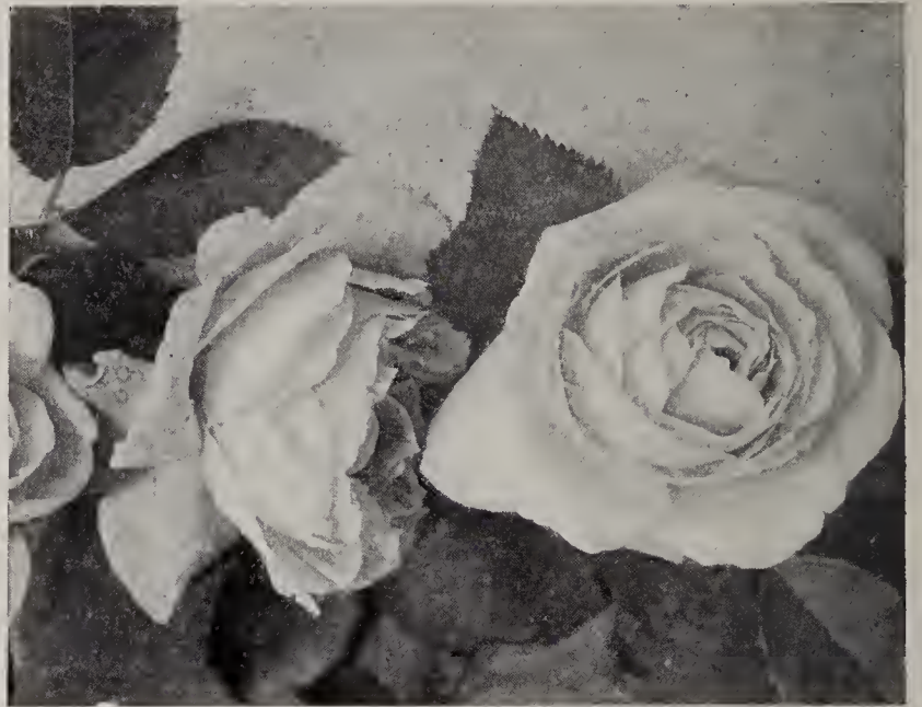
Radiance is very vigorous and blooms freely