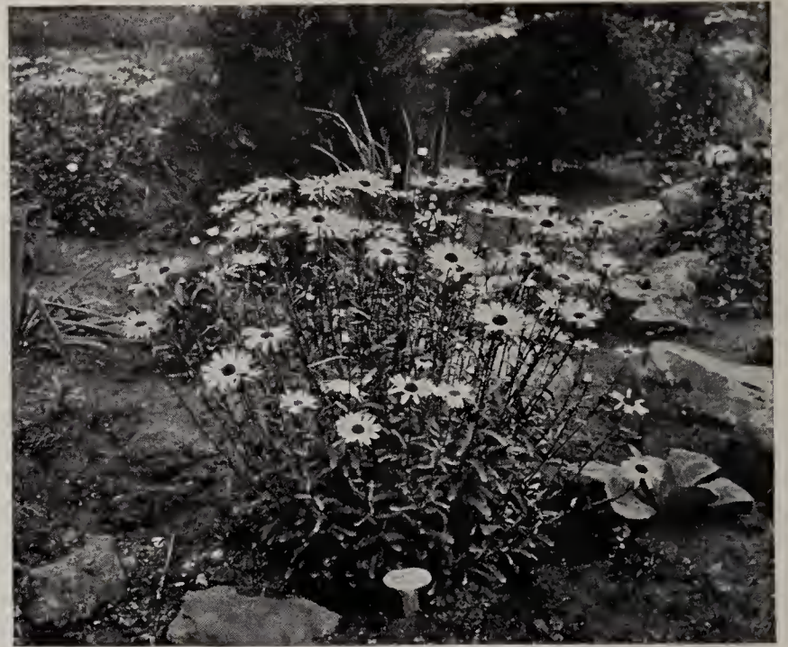
Daisies give a profusion of flowers

Covered with small, fuzzy, azure-blue flowers like Ageratums during latter summer; sun or partial shade; starts growth late; (12-24 in.) 15c each, 3 for 40c, $1.50 per doz.