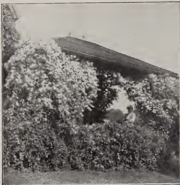
The fragrance of Clematis paniculata resembles English Hawthorn

With a lavish hand nature throws a drapery of vines over the unsightly. An old tree, which cannot be removed, may be made a thing of beauty. Fences become beautiful screens. The bare arch, pergola or summer house is neither useful nor attractive, but vine-clad it bring a tone of dignity to the garden. It is then unnecessary to have it elaborate, often simple or rustic effects are best.