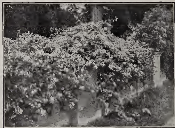
Hall Japanese Honeysuckle, excellent for covering walls

A shrubby form with evergreen leaves 1½ to 2 in. long, excellent as a dwarf plant among or in front of evergreens, in the foreground of shrubbery, among rocks and as a foundation plant; if planted near a support will climb some; in autumn its red berries somewhat resemble those of the Bittersweet. 2 year, 35c each, $3.00 per 10; Mail size, postpaid, 25c each. $2.00 per 10.