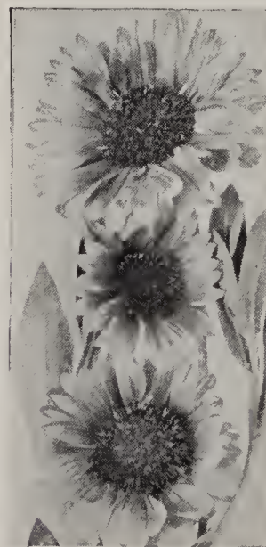
Blanket Flower (Page 21)

A little booklet mailed free on request. It describes the varieties and tells how to plant and prune. It gives the characteristics of the different classes. It contains a lot of information in a little space. If you haven't a copy, write for it.