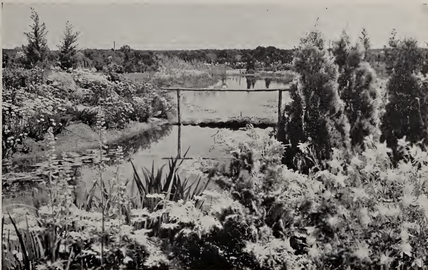
View at Sarcoxie Nurseries

Much of the charm of the hardy garden lies in the pleasing changes constantly taking place. Each day during the growing season brings something new to interest and delight. Before the snow is gone the Crocuses and Snowdrops are in bloom. How eagerly we watch for the Violets and Bleeding Heart, followed by a host of flowers—Peonies, Irises, Delphiniums Sweet Williams and early Daisies. Then the summer flowers, Phlox, Coreopsis, Blanket Flower, late Daisies, etc. Even after frosts the Chrysanthemums keep up the succession of beauty.