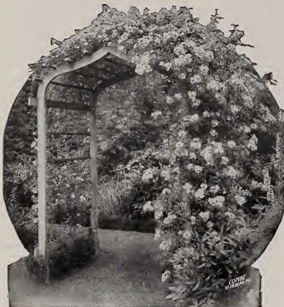
For an arched entrance what can be more appropriate?

During their season these give more flowers and a greater display than any other roses grown. Is the porch sunny and bare? Climbing roses provide both shade and beauty. Is there an arbor you wish to beautify? Use roses. Have you an unsightly fence? Ramblers make the prettiest fence imaginable. Have you a view you wish to screen? A trellis with roses will make your screen a thing of beauty. Is there a rough or stony slope you wish to beautify? Cover it with ramblers. Do you want an arched entrance to the rose garden? What can be more appropriate?