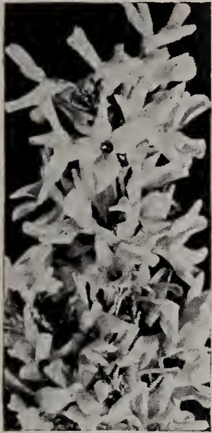
Forsythia (Page 5)