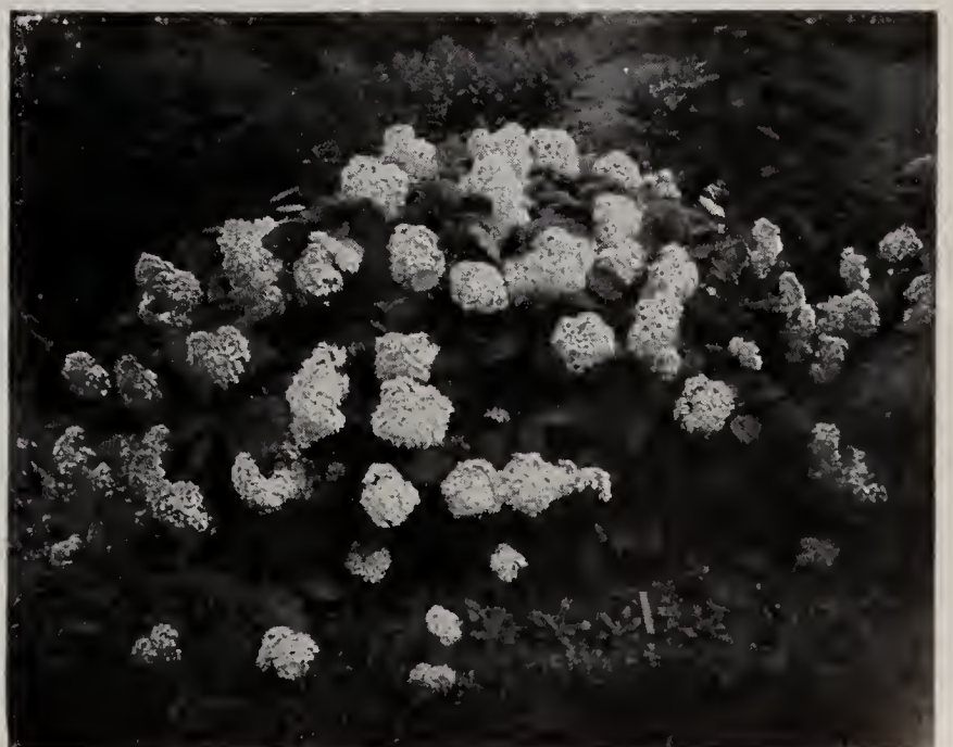
This Hydrangea is well named Hills of Snow