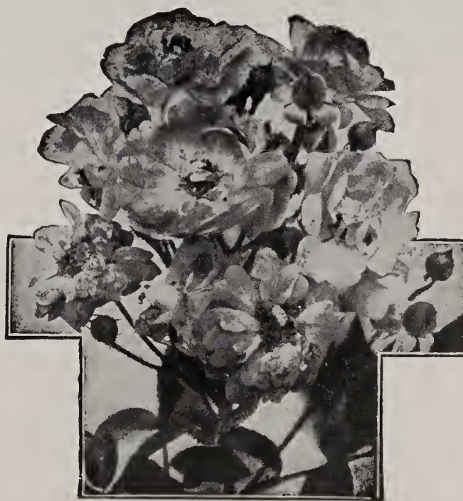
This shows the type of Roses of Ideal and Orleans, page 18, and the Dorothy Perkins class, page 20

Excellent buds and blooms; rich pink overcast with a yellow glow; a strong grower and persistent bloomer; some growers prefer it to Los Angeles; both are beautiful; Per. 50c each.