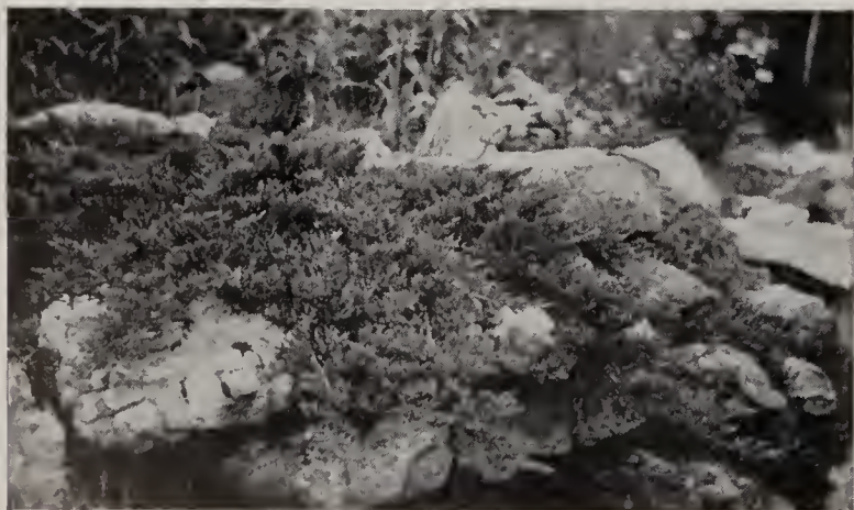
Trailing Juniper in Sarcoxie Nurseries rock garden