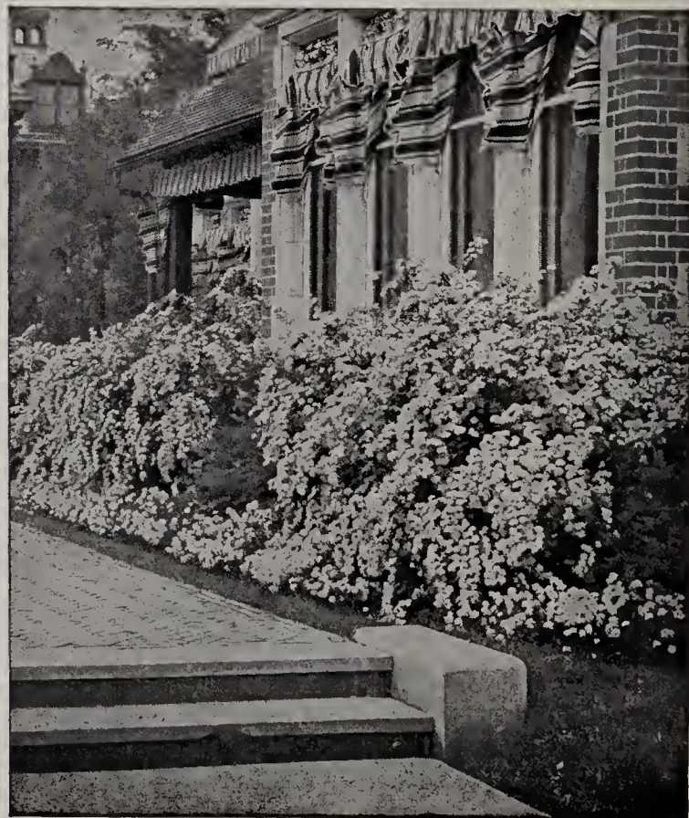
Spirea Van Houttei, a fountain of white in May or June