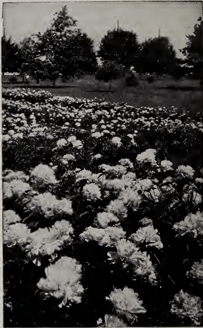
The Peony rivals the rose in fragrance, beauty and variety of form