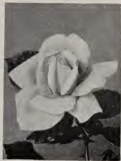
Souv. de Claudius Pernet

Beautiful buds opening into a striking sunflower-yellow without orange shadings, the edges of the recurving outer petals somewhat lighter; fragrant; foliage glossy, deep green; blooms freely, early to late; best in sunny weather; Per. 50c each.