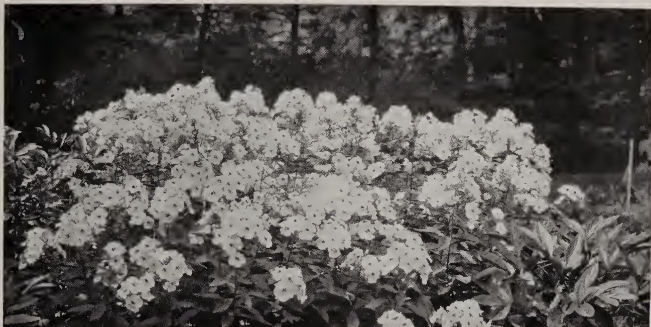
Phlox give brilliant summer effects. Strong field grown plants, $2.00 per dozen