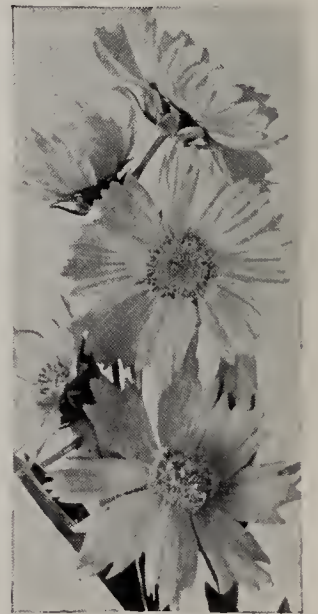
Coreopsis (Page 22)