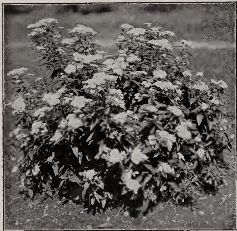
Spireas Anthony Waterer is an excellent dwarf summer blooming shrub