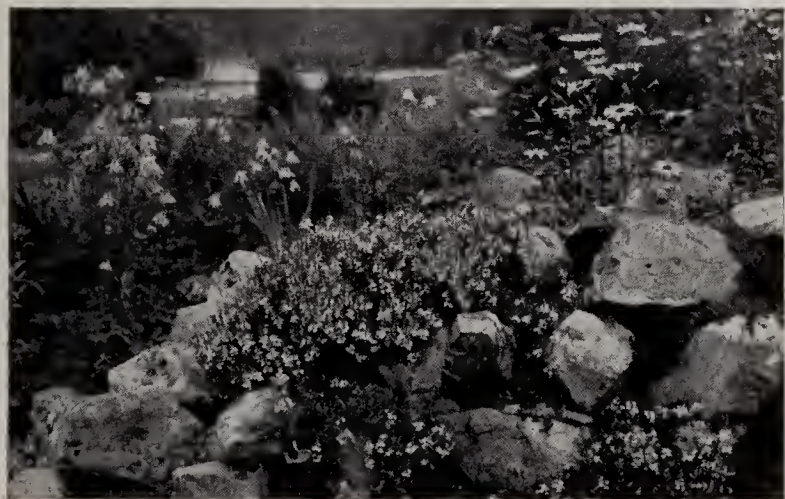
Veronica rupestris at Sarcoxie Nurseries Bright blue flowers in late April or early May (Page 25)

A magnificent Chinese lily; white, center flushed yellow, sometimes tinged pink; outside of petals tinged purplish; delightful fragrance; easily grown; vigorous, reaching, when the bulbs become large, a height of 4-5 ft.; blooms freely. 4-5 in. around, 15c each, 3 for 35c, $1.25 per doz. Postpaid, 20c each, 3 for 45c, $1.45 per doz. Two year size, 5 for 50c, 12 for $1.00 postpaid.