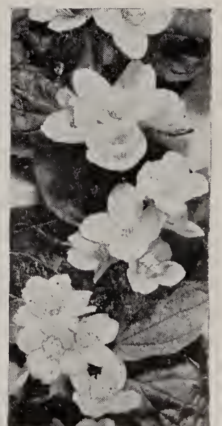
Mock Orange (Page 6)