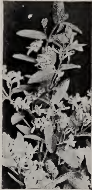
Bush Honeysuckle (Page 5)