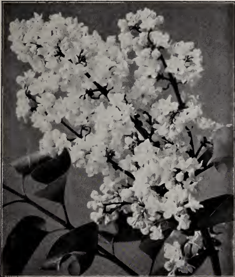
For fragrance in early spring nothing can displace the Lilacs