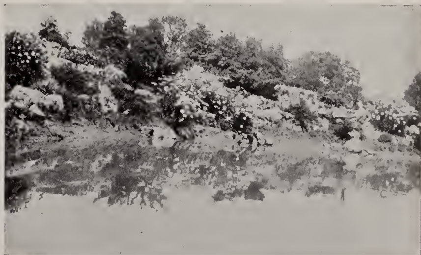
Rock garden on the steep bank of a pool, showing the use of distant trees for a background