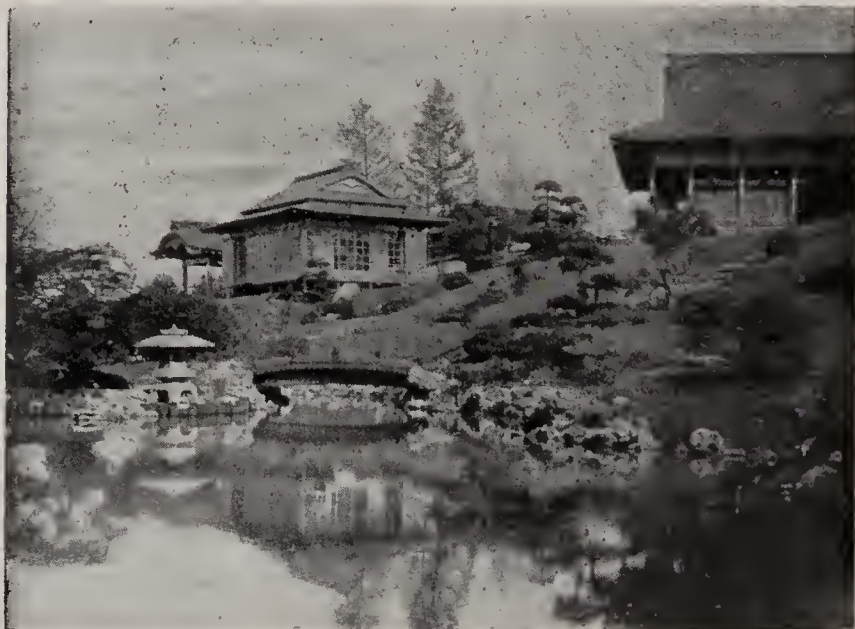
A real Japanese garden showing use of dwarf, creeping and informal evergreens

Planting balled evergreens is like planting potted plants. Properly handled, they transplant as easily and successfully as shrubs. Unpack as soon as received. Protect the roots from sun and wind. Dig a hole just a little deeper than the ball of earth and at least 6 inches wider all around. Set the tree in the hole, burlap and all. As the earth is filled in tamp it firmly , to within a few inches of the top. Untie and cut away the remaining burlap. Water well and finish filling the hole, but do not tamp after watering. About 1/10 of THOROUGHLY ROTTED manure may be mixed in the soil, and some cow manure applied on top as a mulch. Trees cannot do their best without plenty of plant food, and water as needed, particularly during the first year.