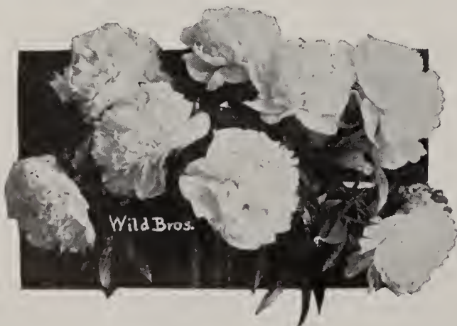
Duchesse de Nemours

Famous for its beauty. Snowy white, reflecting the golden stamens and lighting up the flower; center petals beautifully flecked and bordered carmine; large semi-rose type flowers; late; growth upright, vigorous, with very strong stems; blooms freely. 35c each, $3.50 per doz.