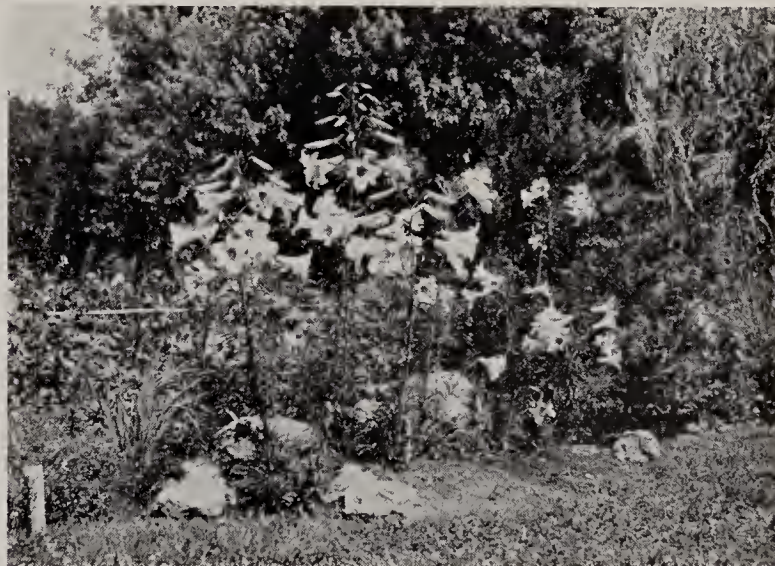
Regal Lilies at Sarcoxie Nurseries

The front belongs more or less to the public, the back is our opportunity to develop an outdoor living room for recreation and enjoyment. In most cases one corner may be made a children's outdoor play room with just a little fixing up. Perhaps a tree or two, a few shrubs to partially screen it from the rest of the yard, and some flowers for color and interesting detail. Give the kiddies a sand pile, a swing, perhaps a teeter board. Here, away from the dangers of the street, they may amuse themselves for hours, and develop naturally without too much restraint. As they become older, give them a little hardy garden. Haven't you observed how eagerly they watch for the first flowers of spring, how they enjoy picking the flowers in the woods, free to all who come? Teach them to care for flowers and they will love them all the more. In their own little garden, where all summer long they feel free to gather flowers for themselves and their childhood friends, they will early learn the joy of giving, and will unconsciously carry into later life the lessons they have learned.