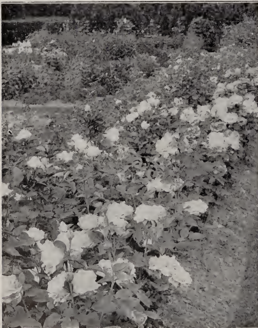
Everblooming Roses bloom the first summer

Pretty, slender, pointed buds opening into cupped flowers of good size; apricot yellow becoming lighter as they age; delightfully fragrant; deep green, disease resisting foliage; few thorns; a constant bloomer, greatly admired; T. 50c each.