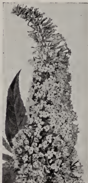
Butterfly Bush (Page 4)