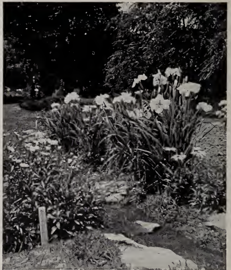
Showy Japanese Irises for tall borders or at the water's edge

Prospero —Very large; standards lavender suffused yellow at base, falls purple slightly reddish; fragrant; late; midseason; fine; 3½ ft. 25c each, 3 for 70c, $2.50 per doz.