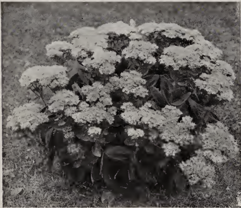
Sedum spectabilis Brilliant

Showy in summer when few perennials are in bloom, with its single golden-yellow daisy-like flowers, the center a purple cone, on stiff, wiry stems up to 3 ft. high; a perennial form of Black-eyed Susan. 15c each, 3 for 40c, $1.50 per doz.