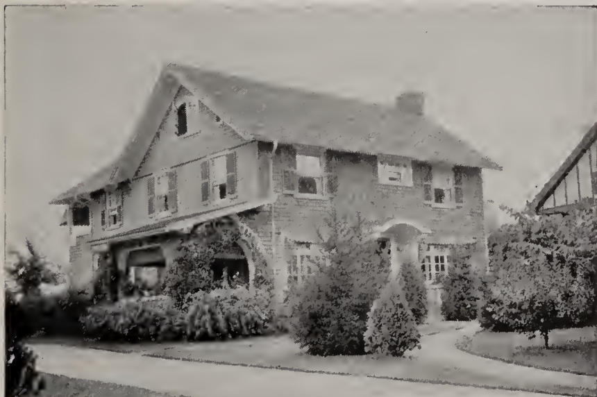
Evergreens add winter beauty to the planting