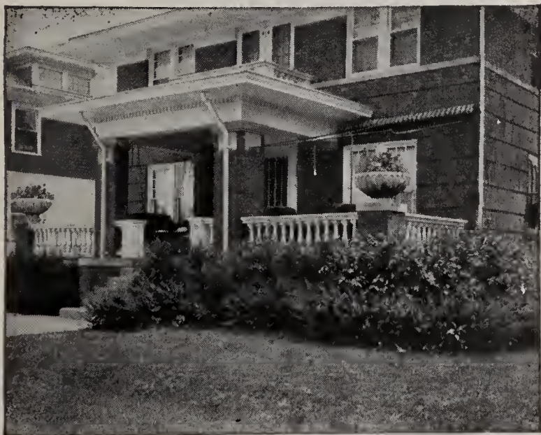
Foundation planting of Barberry and other shrubs

Shrubs make a beautiful display in a year or two, giving the lawn and dwelling an attractive, finished appearance. They appear to best advantage in groups along the boundaries or division line of properties, at the edges or corners of lawns, and near