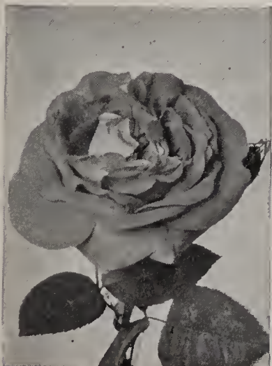
Gruss an Teplitz

Large, pointed buds; double, high-centered blooms; brilliant rose-pink; blooms freely on long, stiff stems; fragrant; the flowers keep well; vigorous; a sport of Columbia; foliage resistant to disease; H. T. 50c each.