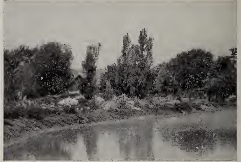
Phlox and Dwarf Sedum, with trees as a distant background, at the Sarcoxie Nurseries

Sedum kamtschaticum. Grows about 6 in. high; triangular, deep green leaves; starry orange-yellow flowers \frac{3}{4} in. across in clusters 1 to 3 in. across at intervals during summer; suited to partial shade. 15c each, 3 for 40c, $1.50 per doz.