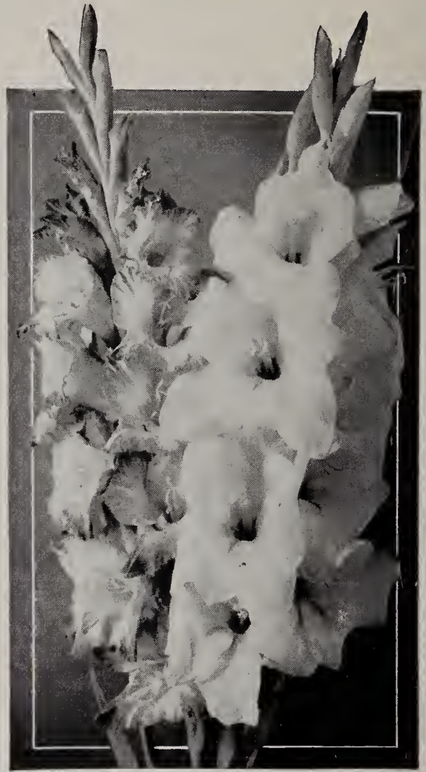
Gladiolus, the easiest flower grown

Lucretia —Large, often 1½ in. long; sweet, luscious; unexcelled in size and quality by any blackberry; ripens at the end of the strawberry season, before Early Harvest. 50c per 10, $1.00 per 25, 50 or more at $3.50 per 100, 500 at $30.00 per 1000.