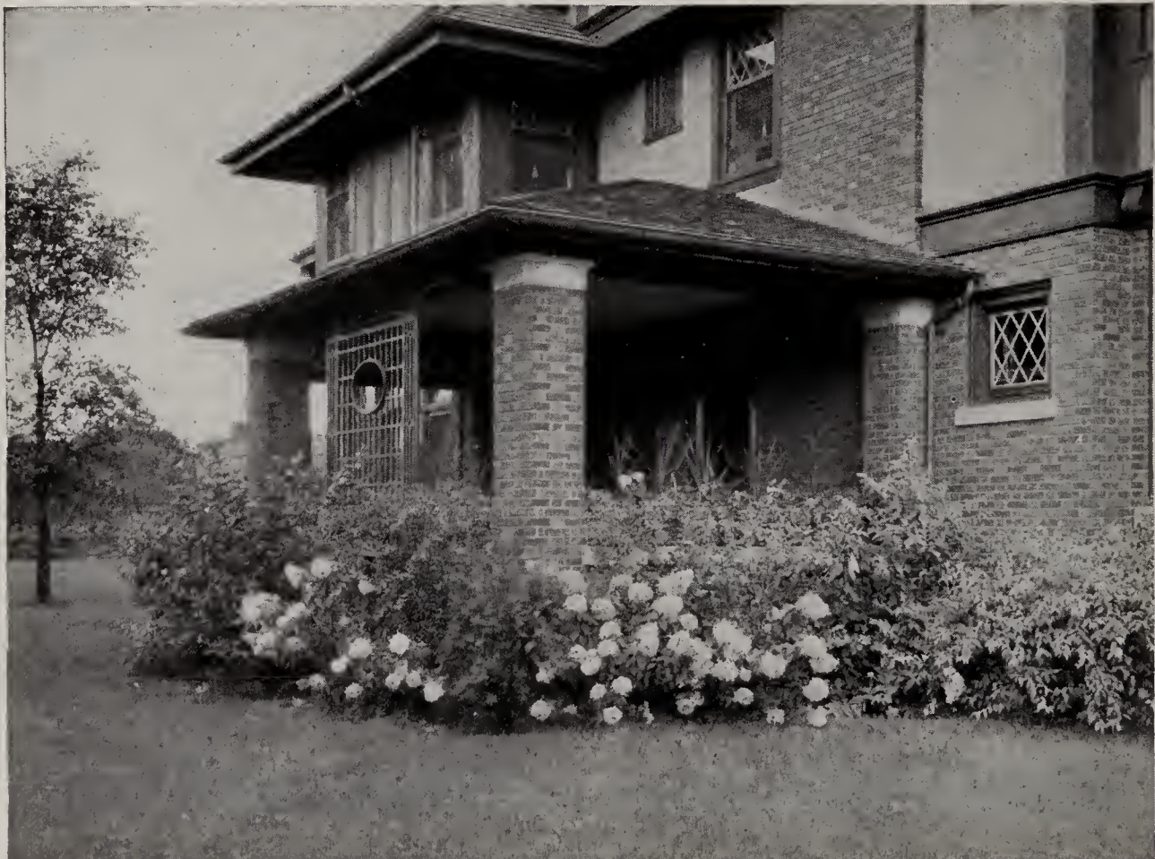
Hydrangea paniculata grandiflora and other shrubs used as a foundation planting

Mail size, postpaid _____ $0.20 each, $1.75 per 10 12 to 18 inches _____ .25 each, 2.00 per 10 18 to 24 inches _____ .40 each, 3.00 per 10 2 to 3 feet _____ .60 each, 5.00 per 10 3 to 4 feet _____ .80 each, 7.50 per 10 4 to 5 feet _____ 1.50 each, 12.50 per 10