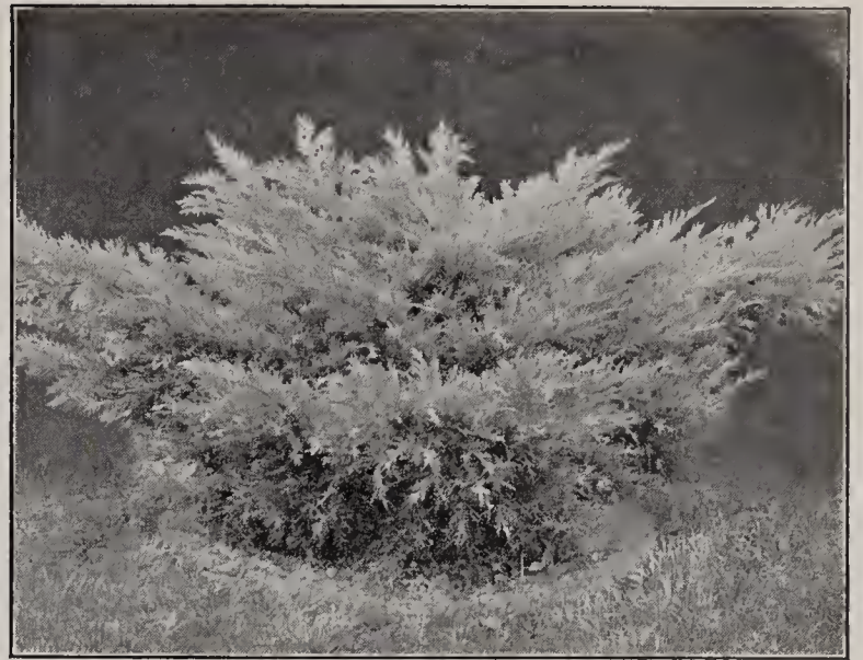
Pfitzer Juniper thrives in almost every location