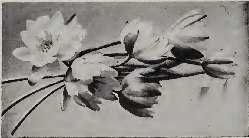
Water Lilies all summer

To have hardy Water Lilies blooming from May till frost you need only a pool, 8 to 12 inches of good soil, a foot or more of water, and sun. Once established, they are the easiest flower grown—no cultivating, no weeding, no watering, except to see that the pool does not become dry. They need not be taken up during winter if the water is deep enough so it will not freeze to the soil. In some soils a concrete pool is not necessary. When needed, it costs little. Instructions for construction will be sent on request. When grown in boxes the boxes should be about 8 inches deep and 14 or 16 inches square.