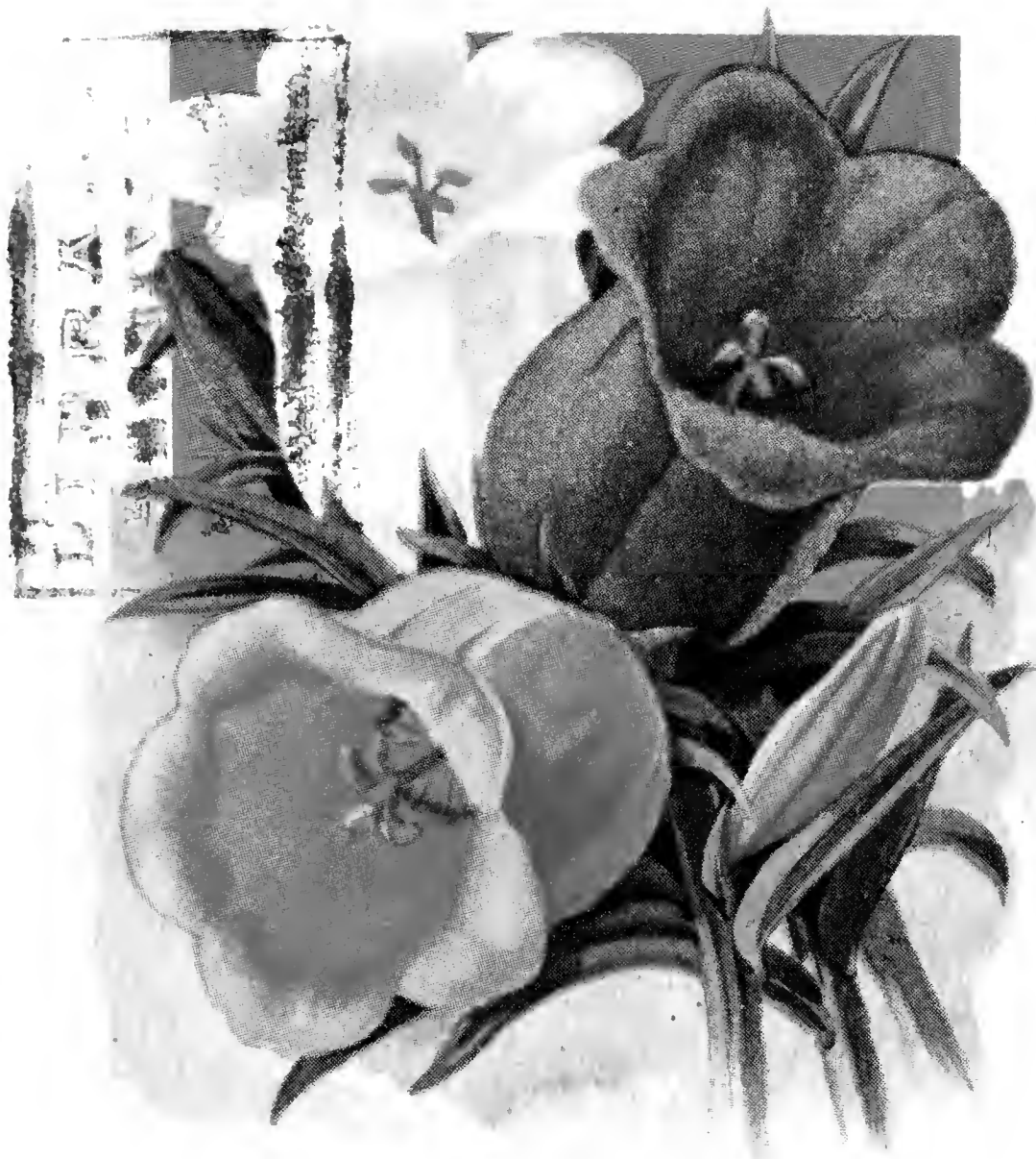
ANNUAL CANTERBURY BELLS (Mixed)