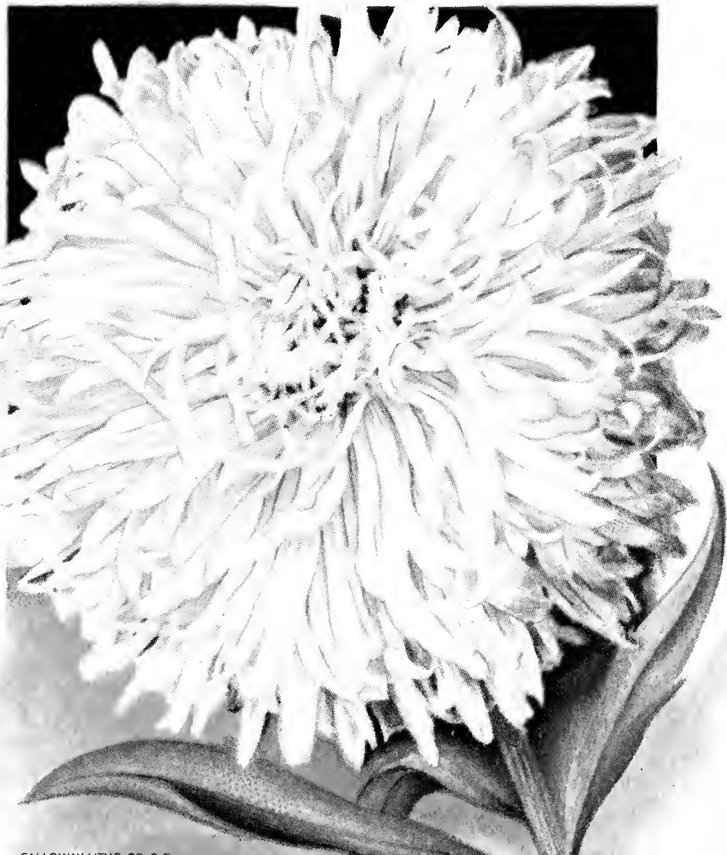
ASTER NEW SUPER GIANT LOS ANGELES

145 N. Broadway -- LOS ANGELES, CALIF. -- Tel. MUtual 1757