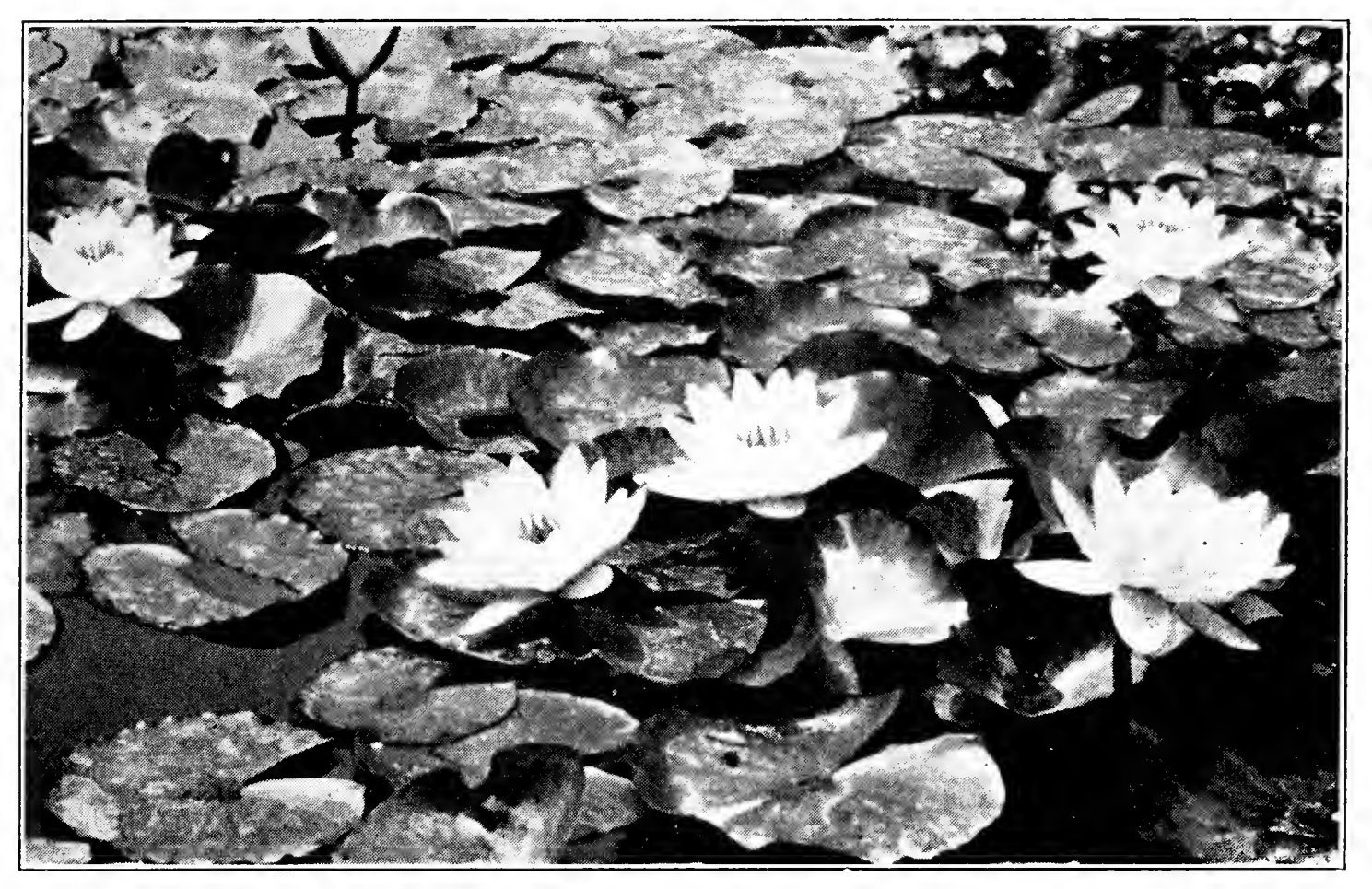
Gladstone. (See page 3)