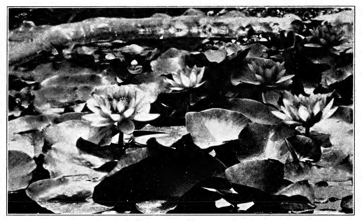
Conqueror. (See page 3)