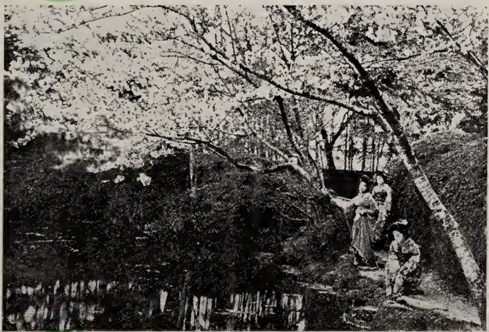
Japanese Flowering Cherries.

Always the new and unusual for those who love fine plant material