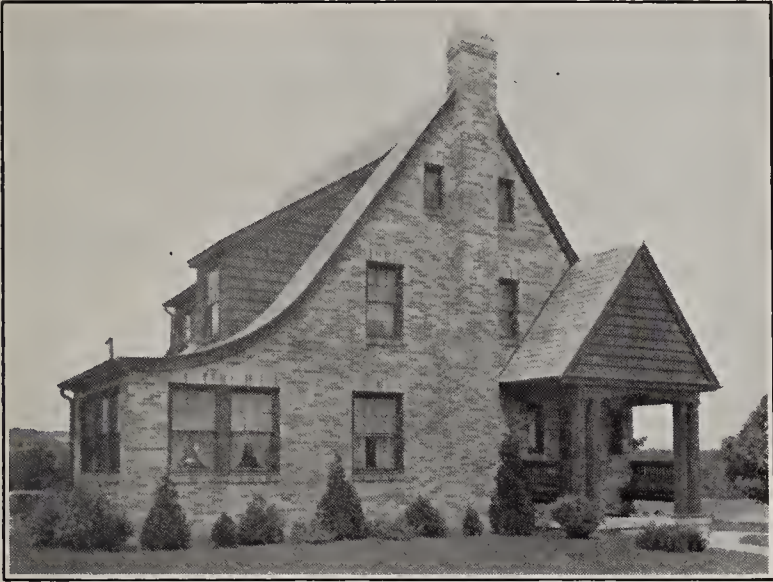
A Well Balanced Foundation Planting