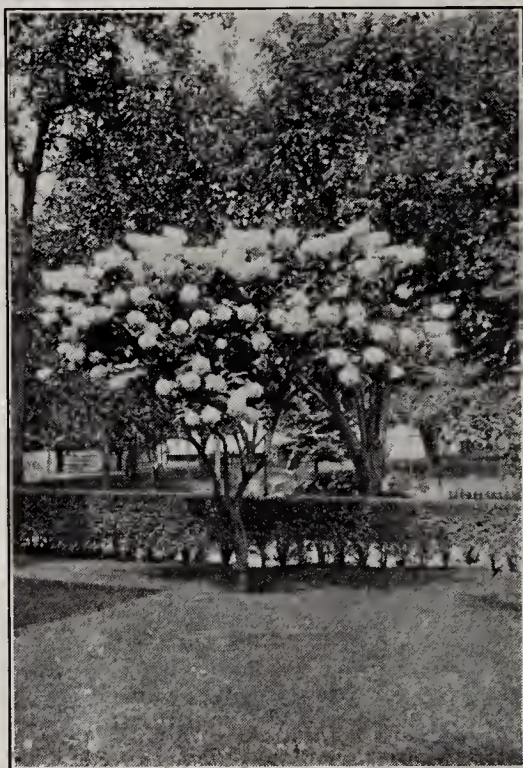
Tree Hydrangea and California Privet Hedge