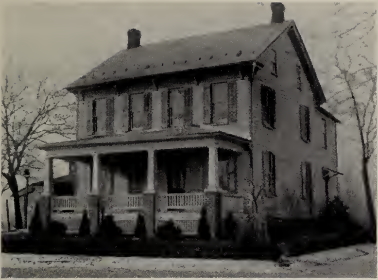
Planting Adds Beauty to Our Home