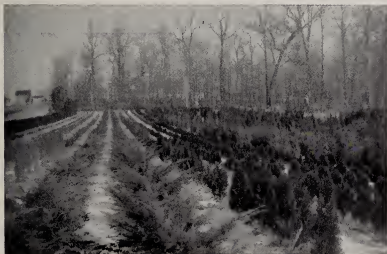
One of Our Evergreen Blocks

All prices on Evergreens include B. & B.