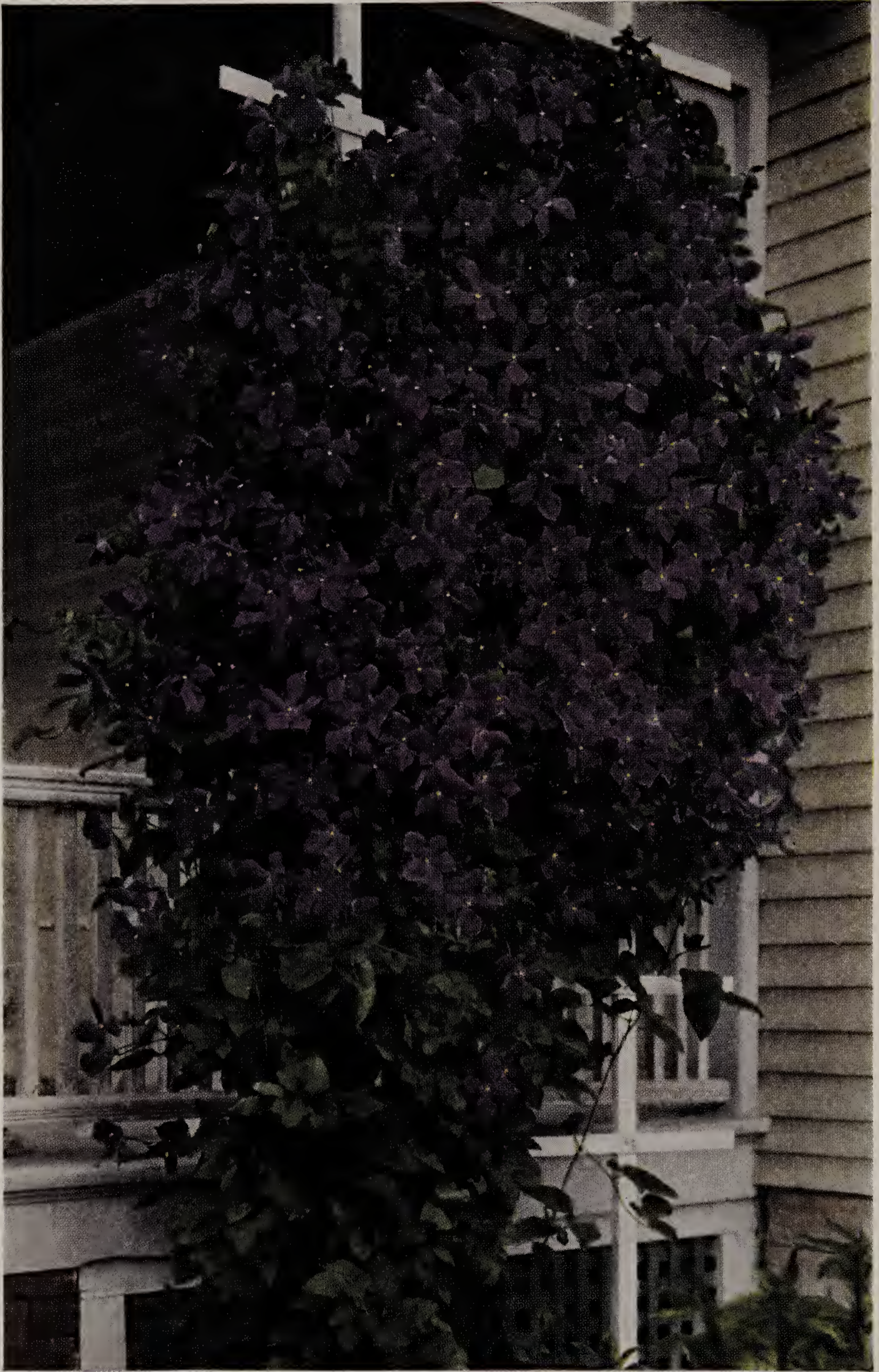
Clematis Jackmani. A vine of overwhelming gorgeousness suitable for trellis or porch decoration. Easy to grow. Blooms over a long season. Perfectly hardy and attracts favorable attention everywhere.