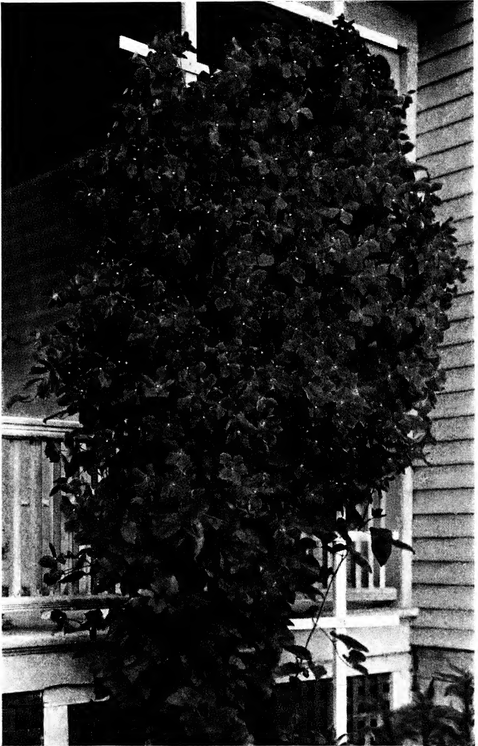
Clematis Jackmani. A vine of overwhelming gorgeousness suitable for trellis or porch decoration. Easy to grow. Blooms over a long season. Perfectly hardy and attracts favorable attention everywhere.