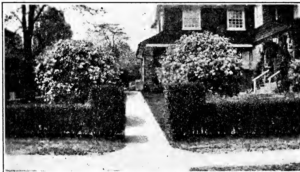
Malus Atrosanguinea, Carmine Crab