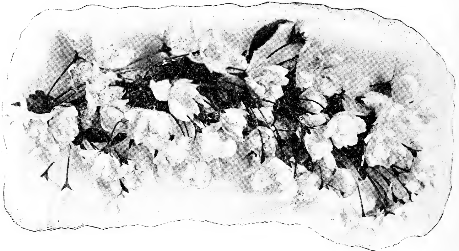
Malus Parkmani or Malus Halleana