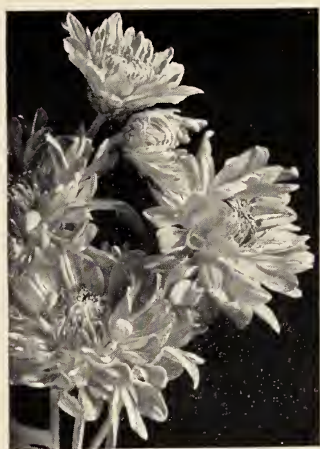
Hardy Chrysanthemum, ALADDIN.