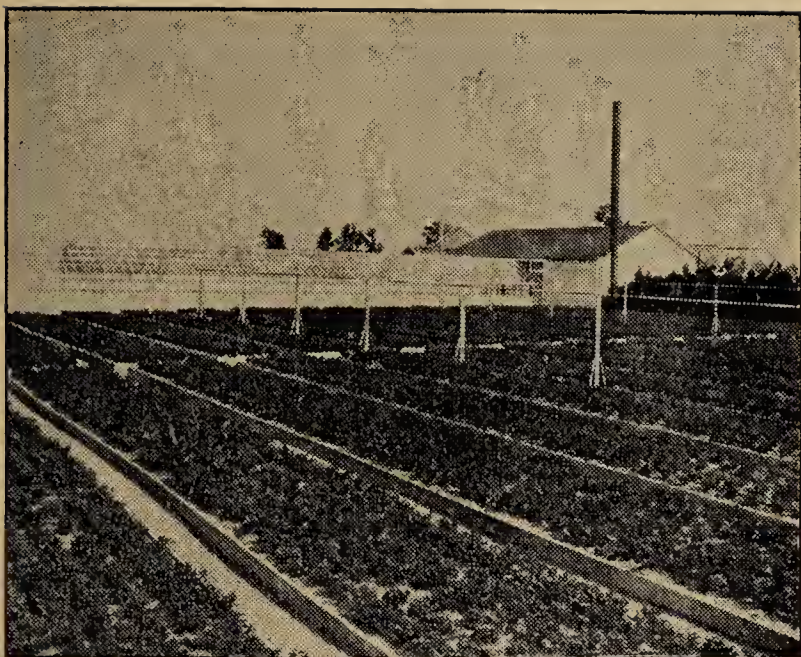
Azalea Kurume Coral Bells Grown at Le-Mac Nurseries