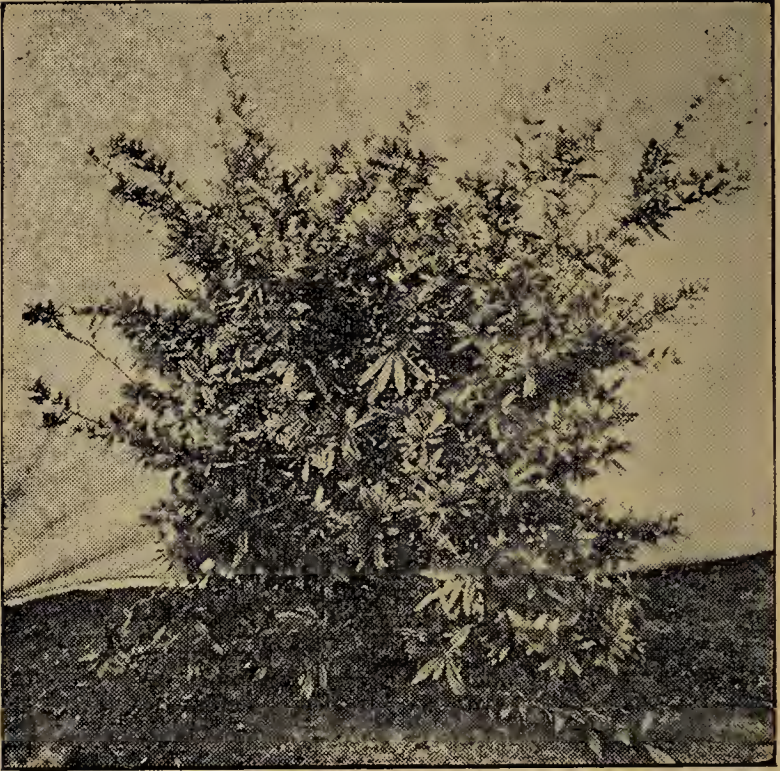
Berberis Julianae , Wintergreen Barberry

BERBERIS. Evergreen barberries with their attractive foliage throughout the year are highly recommended for hedges and are very good for specimen bushes. They have dainty yellow flowers in Spring, and do best in a moist, well-drained loam.