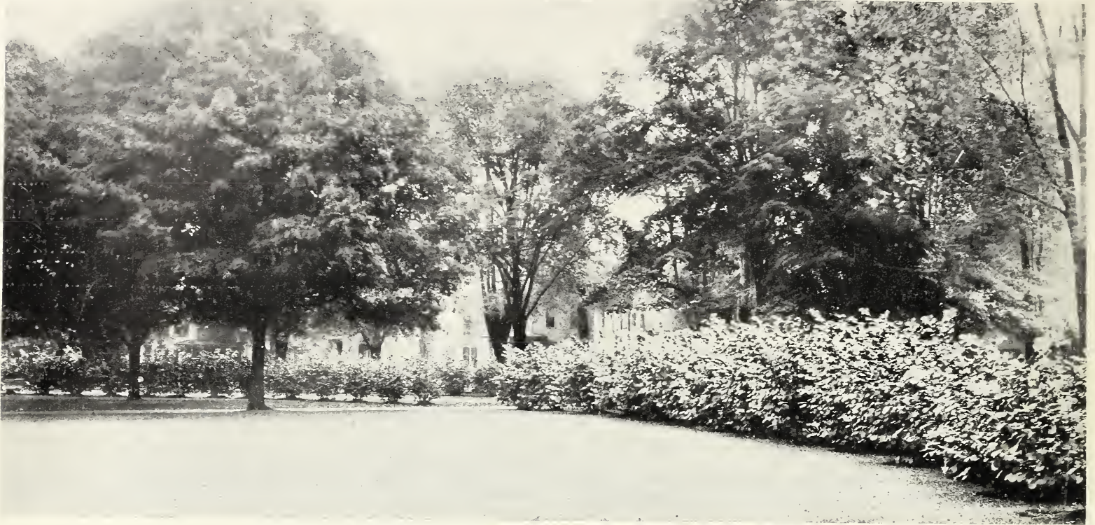
Showing How Artistically Filberts Can Be Planted Along the Walks or Driveways.