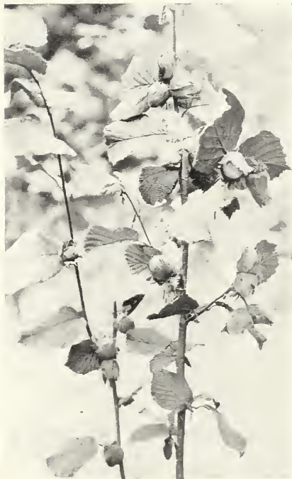
Two-year Plant in the Nursery Row, Bearing 18 Large Nuts.