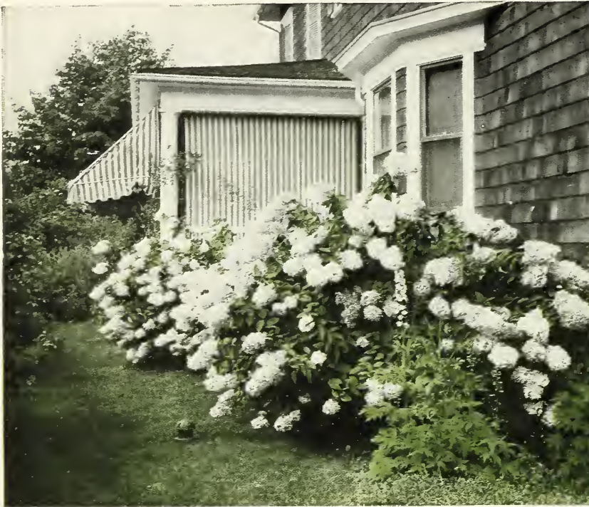
Hydrangea Paniculata Grandiflora.