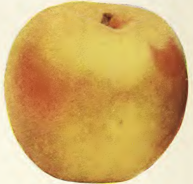
Winter Banana Apple.

YELLOW TRANSPARENT. One of the best extra early apples for all sections. Good size, clear white, turning to pale yellow; flavor acid, very good. Bears very young, yields immense crops every year. Extremely hardy.