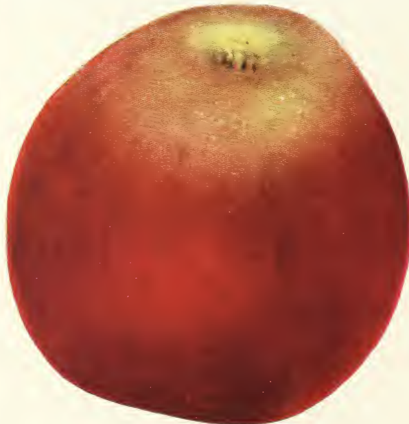
Stayman's Winesap Apple.

GRIMES GOLDEN. The most popular golden apple, prized for its beauty and quality. Golden, transparent yellow, tender, rich and delicious; keeps well without losing any of its crispness or flavor. One of the best for fancy box trade.