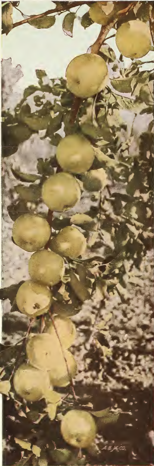
Yellow Transparent Apples.