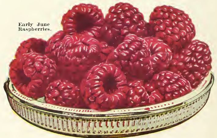
Early June Raspberries.