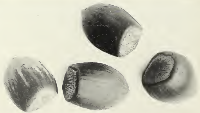
Improved Filberts—Actual Size.

OUR PEDIGREED VARIETIES ARE ENDORSED BY THE NORTHERN NUT GROWERS ASSOCIATION AND PLANTS ARE GROWING AND FRUITING SUCCESSFULLY IN THE UNITED STATES GOVERNMENT EXPERIMENT GROUNDS AT WASHINGTON, D. C.