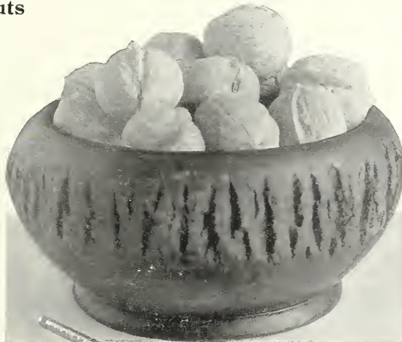
Wiltz Mayette English Walnuts.

THOMAS. Originated in Pennsylvania, one of the finest and best of all large nuts in cracking qualities. Nut very large, with large kernel, and of very good quality. Tree a wonderful grower. 3 to 4 ft., $2.50 each.