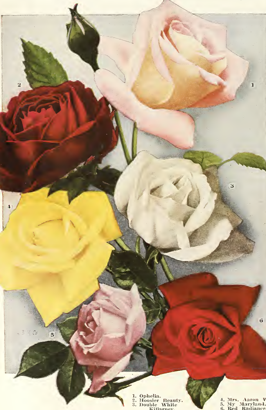
1. Ophelia. 2. Hoosier Beauty. 3. Double White Killarney.

WILLOWMERE. A magnificent rich shrimp pink Rose, toning to carmine pink toward edges of petals. Beautiful coral red buds on stout stems, opening into very large, full flowers.