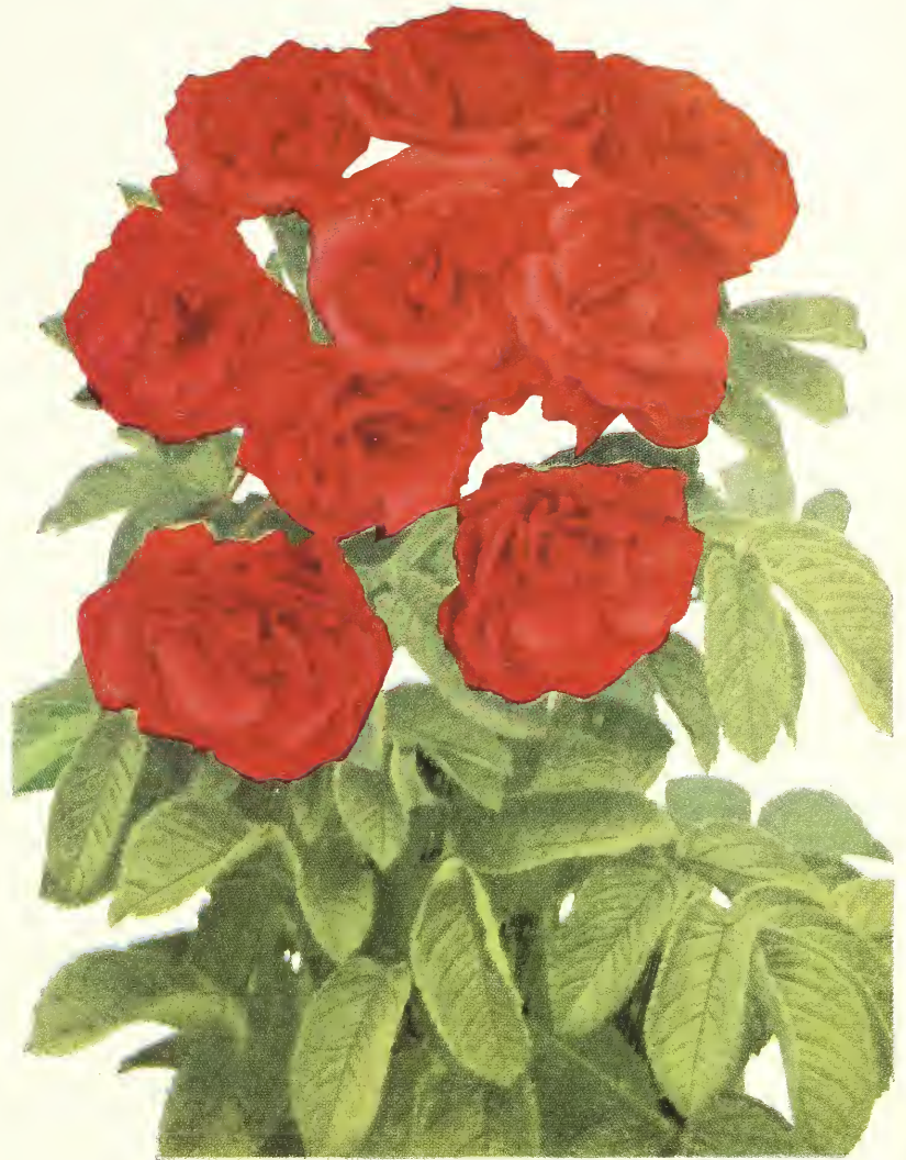
New Everblooming Rugosa Rose—F. J. Grootendoorst.

ULRICH BRUNNER. Bright cherry red, large and full.