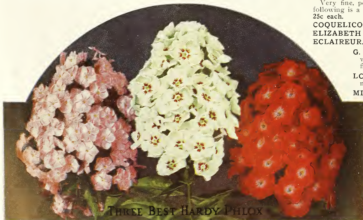
THREE BEST HARDY PHLOX

SELMA. Tender soft pink with crimson center. A lovely variety.