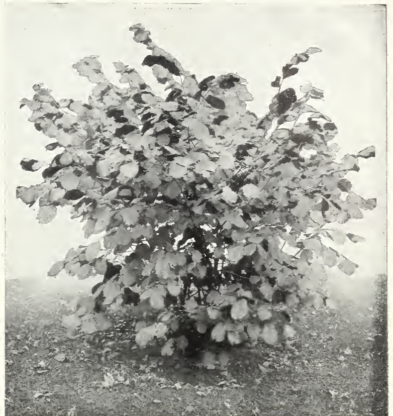
Showing the Beauty of Improved Filberts as a Shrub.

ITALIAN RED. One of the finest of the Improved Filberts. A very large, oblong nut of excellent flavor. Plant a strong, upright grower, very productive, ripens about September 10th.