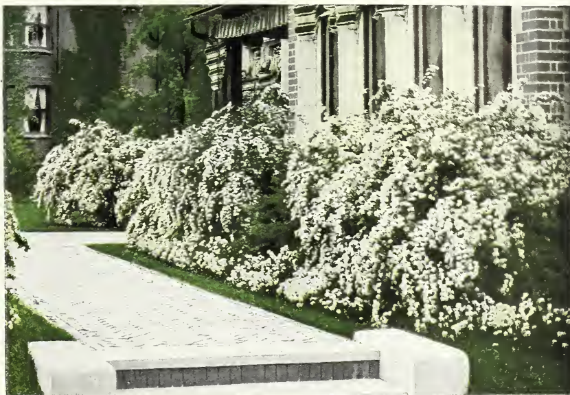
Showing Spirea Van Houttei in its Natural Grace and Beauty as a Foundation Plant.

WEIGELA, Eva Rathke. Charming new variety. Brilliant crimson flowers twice in one season. $1.00 each.