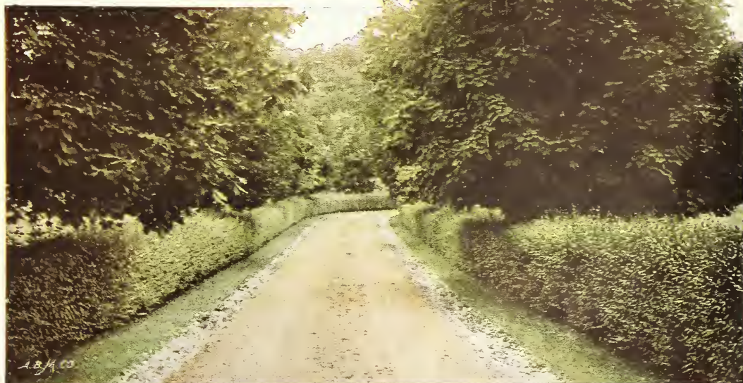
A Very Attractive Roadway—Norway Maples and Privet Hedge Used.