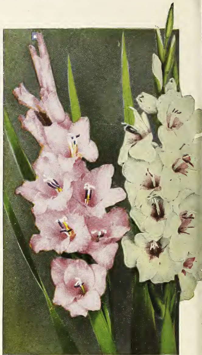
Gladiolus Pink Perfection and Loveliness.

MRS. WARNAAR. (Cactus Dahlia.) Flowers of gigantic size, creamy white with faint apple blossom suffusion. A novelty of unusual merit. $1.50 each.