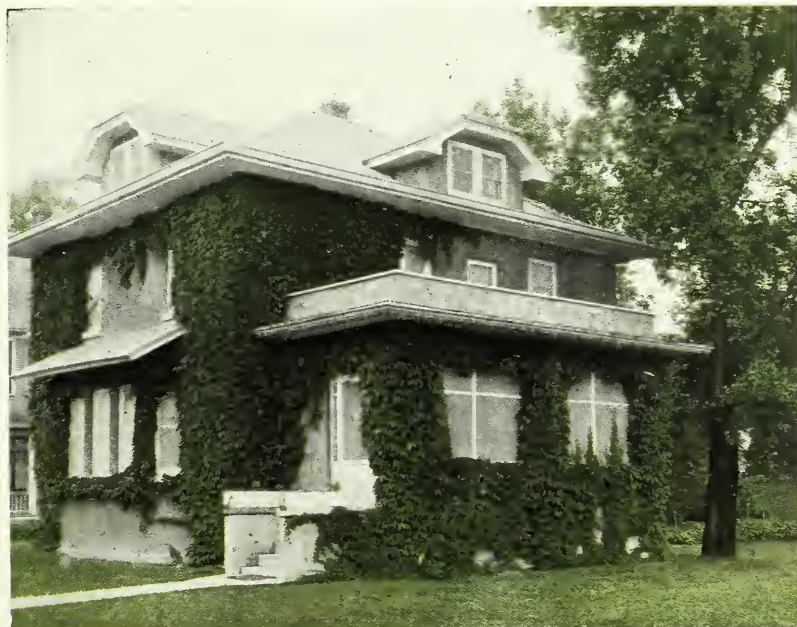
An Effect Obtained by the use of Boston Ivy.

Nothing lends such a pleasing effect to wall or veranda as the judicious use of vines. The hardy vine is best adapted for covering an unsightly wall or for furnishing shade and ornament to verandas. With the advent of spring the tendrils are given new life and as the season advances they soon become a beautiful covering. Hardy vines practically take care of themselves after once established, and are much more desirable and less trouble than the annual or tender varieties. Without climbing vines many beautiful homes would present a sad picture during the hot summers.